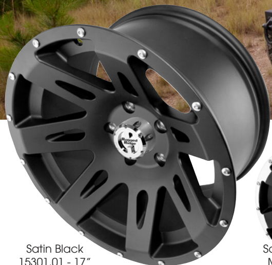
Satin Black 15301.01 - 17" 15305.01 - 18" 15306.01 - 20"