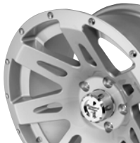
Silver 15301.40 - 17" 15305.40 - 18" 15306.03 - 20"