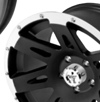
Satin Black with Machined Lip 15301.10 - 17"