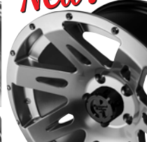
Gunmetal 15301.30 - 17" 15305.30 - 18" 15306.02 - 20"