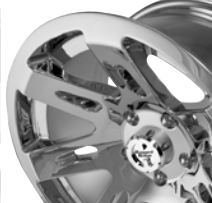
Chrome 15301.20 - 17"