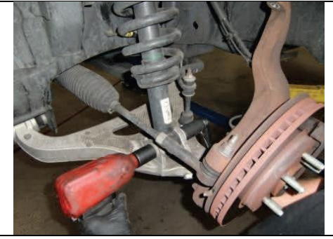
Loosen lower strut bolt/nut and remove.