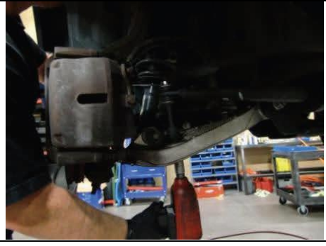
Remove lower sway bar end link hardware.