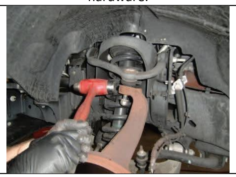
Carefully strike spindle as shown to separate ball joint.