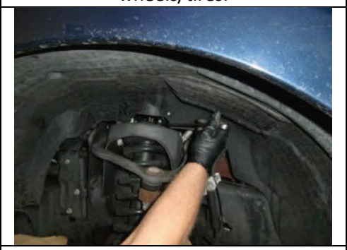
Loosen upper strut mount nuts.