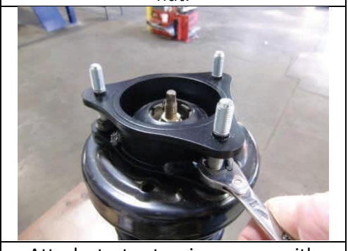
Attach strut extension spacer with GOLD Flange Nuts , tighten.