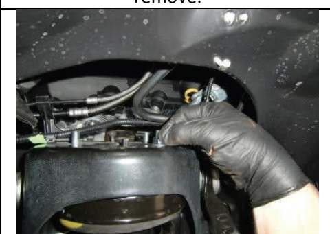
Use SILVER Flange Nuts to re-attach top of strut to vehicle.