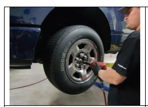
Lift vehicle securely and remove wheels/tires.