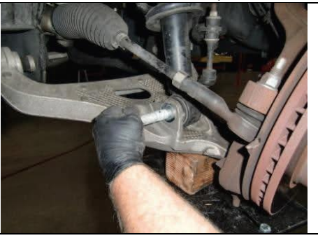
Reconnect lower strut mount and torque to spec.