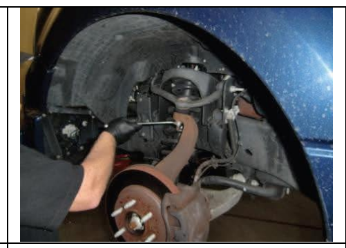
Loosen upper ball joint nut, but do not remove.