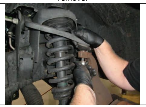
Pull down and remove upper ball joint nut.