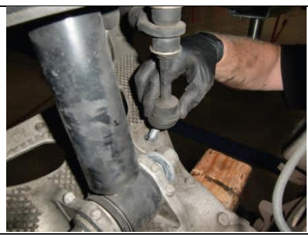
Reconnect lower sway bar end links and torque to spec.

Install wheels and torque to spec., measure and align.