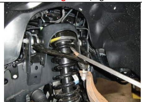
Use jack and pry bar to reattach upper ball joint to spindle.