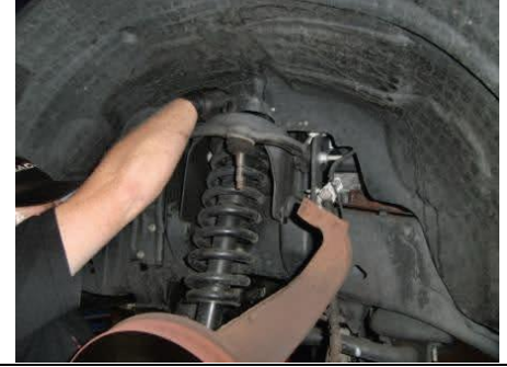
Remove top strut mount nuts and remove assembly.