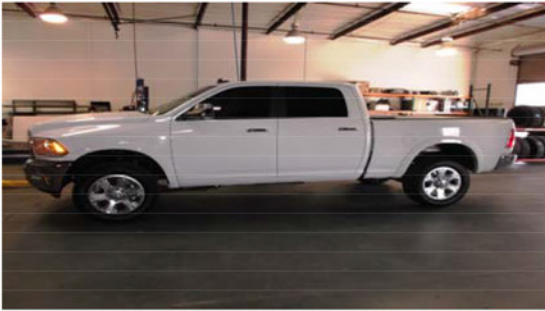
Rear Installation: Place the vehicle on level ground.