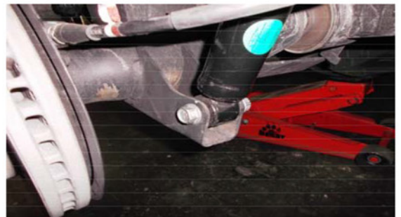
Jack the axle back up to weight the springs then install the shocks.