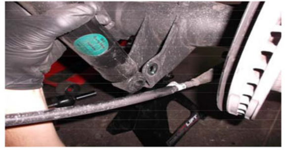
With the axle supported, unbolt the shocks from the axle.