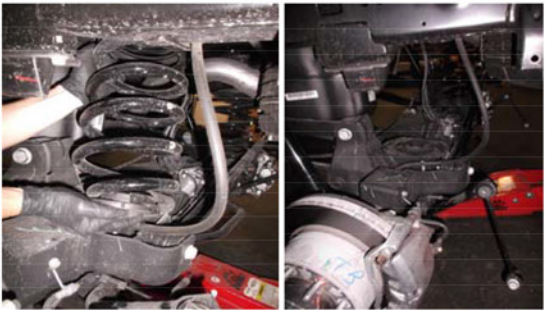
Lower the axle until the springs are loose enough to remove.