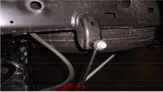
Reinstall the sway bar end links.