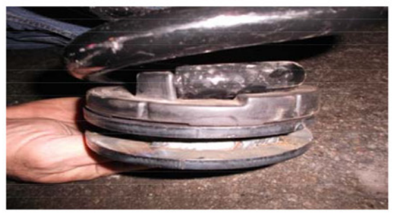
Place the coil spacer under the lower spring isolator.