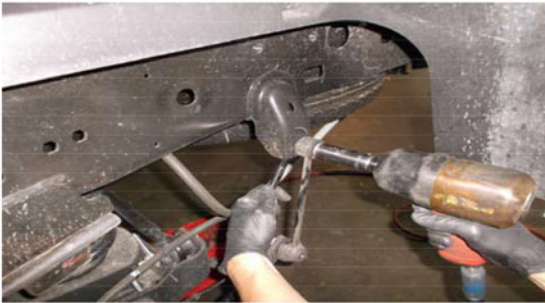
Unbolt the sway bar end links.