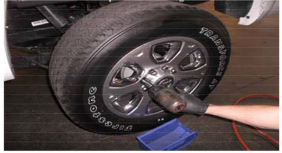
Reinstall the rear wheels.