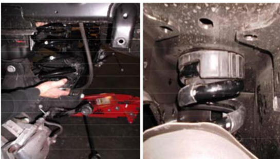
Reinstall the coil spring with the spacer.