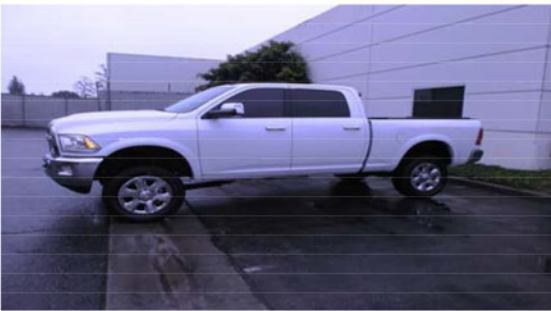
Lower the vehicle to the ground and torque the lug nuts.

Note: Double check all worked performed on the vehicle to ensure correct installation.