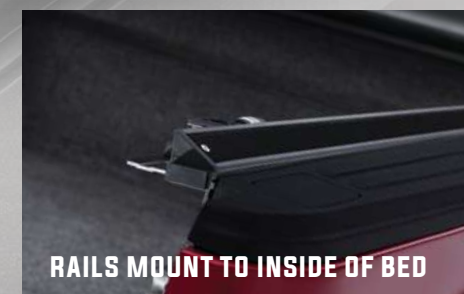
RAILS MOUNT TO INSIDE OF BED