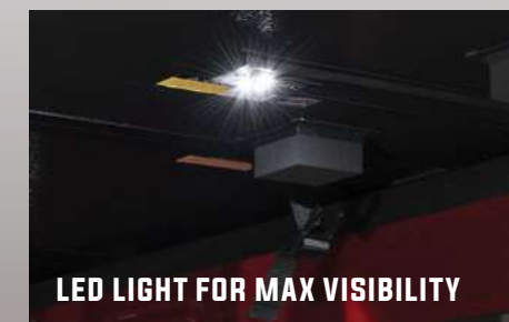
LED LIGHT FOR MAX VISIBILITY