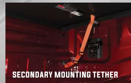
SECONDARY MOUNTING TETHER