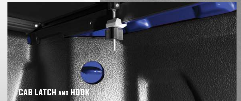
CAB LATCH AND HOOK