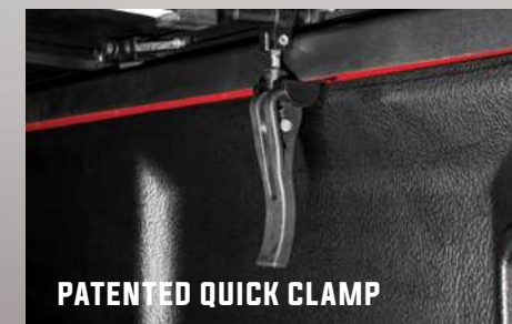
PATENTED QUICK CLAMP