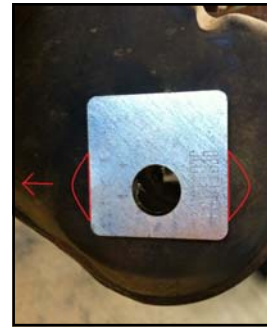
0 degree change from stock. Use like this to weld onto bracket as a repair to a worn out hole