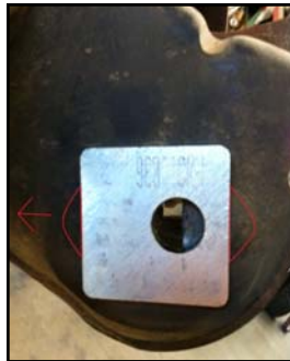
1.5 degree more (positive) caster