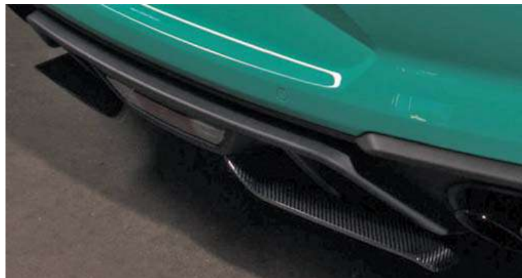
Carbon Fiber Rear Valance Diffuser

Application: 2018 Ford Mustang GT (5.0L V8 Coyote)