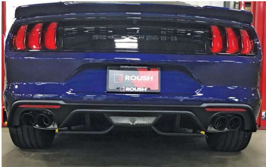
Plastic Rear Valance Diffuser

P/N: 422085 (1318-17F954), P/N: 422125 (R1318-CF17F954)