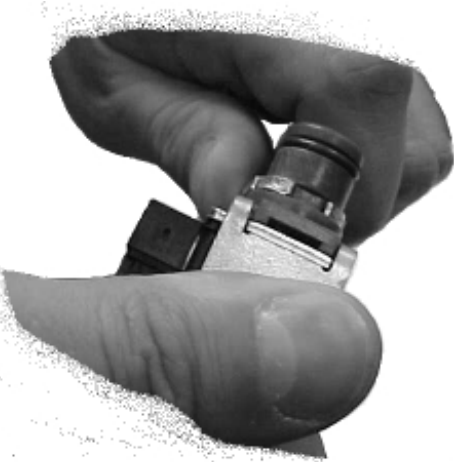
Install the new solenoids as shown, taking care to install the harness in the correct solenoids.