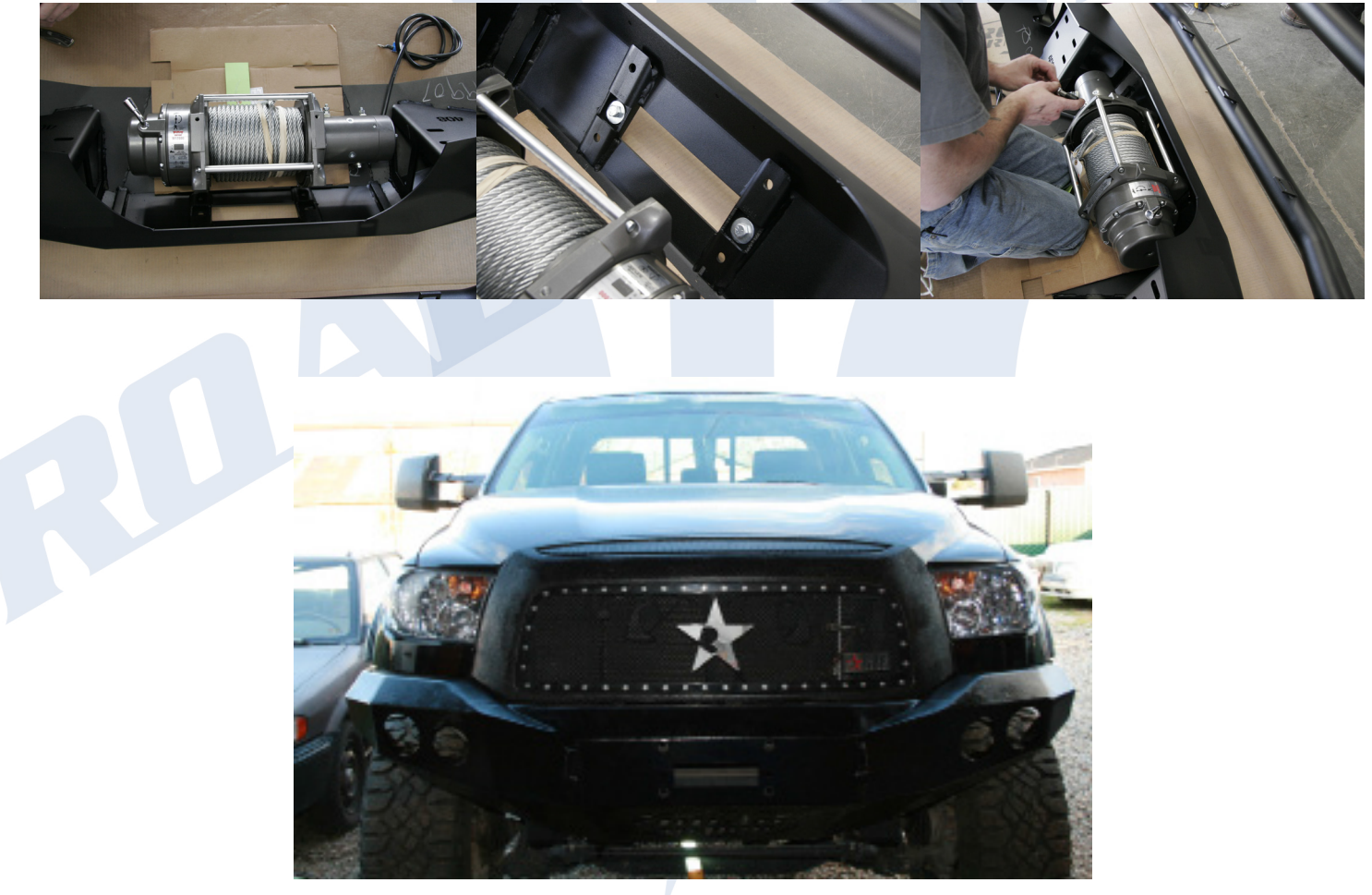
Basque in glory. Congratulations! Time for a cold one!

• Install the winch to the bumper using the supplied Allen Bolts and Washers. Note - Install the Flairlead bolts before you mount the winch.