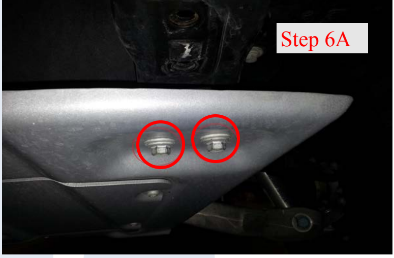
Step 6A Remove Skid plate