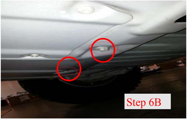
Step 6B: Remove Skid plate