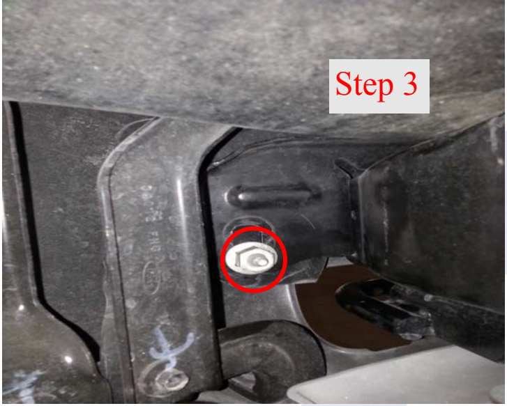
Step 3: Remove outer bumper mounting hardware