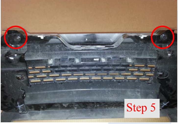
Step 5: Remove hood latch holder