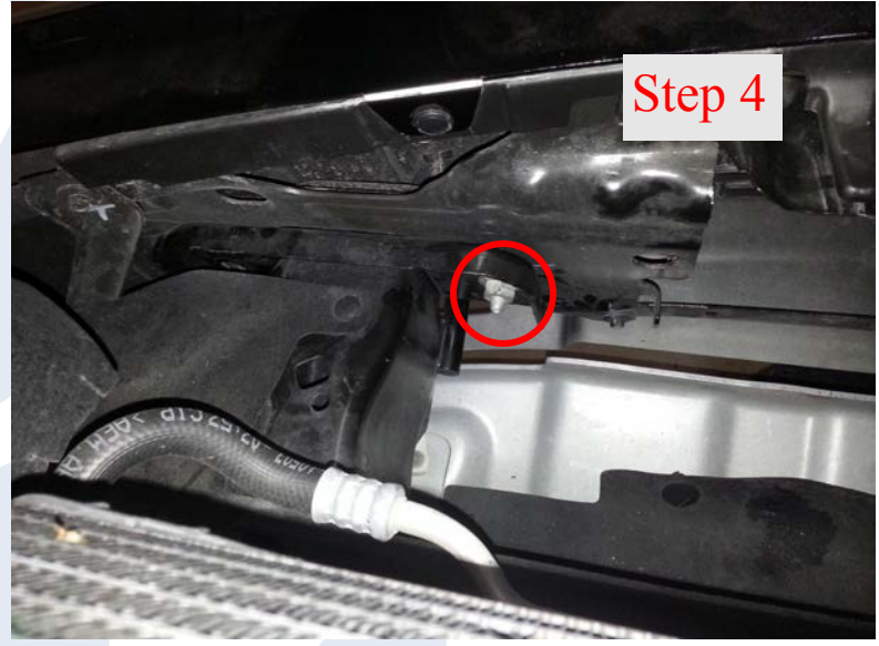
Step 4: Remove inner bumper mounting hardware