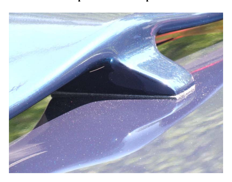
1" Nylon hole plugs

Foam weather strips between the spoiler and trunk lid.