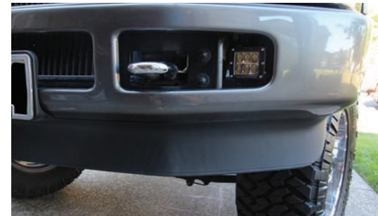
1999-2013 Ford® Super Duty® Fog Light Bracket Kit Mounts two D-Series lights.