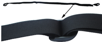
Buckle Side Down

1-Place the first strap buckle-side down (Fig 3). Run the strap's loop-end (without twisting the strap) through the back side of a Car Clip (Fig 4).