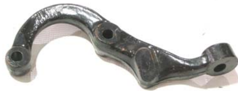
F / X Body