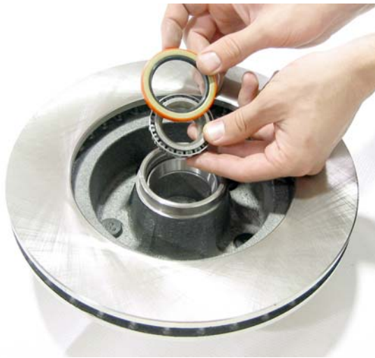
Inner Bearing Assembly

You are now ready to install the bearings and rotor. Start by placing the rotor face down. Races come preinstalled in the rotors. If you received additional races with your bearings, they will not be used. Inspect the bearing area for casting sand and other debris before installing the bearings. Apply a little bearing grease to the bearing race already in the rotor and pack the larger of the two bearings (Inner) with grease. Install the bearing into the rotor and place the grease seal on the rotor. Tap the seal into place being careful not to damage the rubber portion of the seal. A small block of wood works well to protect the seal.