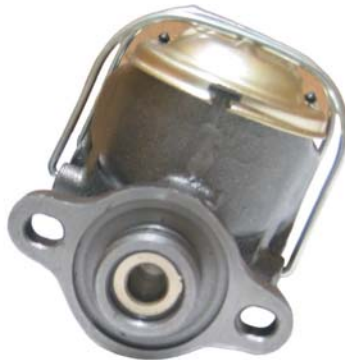
Deep Pocket Illustration

Note: Make certain that you have a deep pocket master cylinder. Make absolutely certain there is no plug in the back of the master cylinder and that you have a hole approximately 1" to 1 1/4" deep in the back of the master. See picture below.