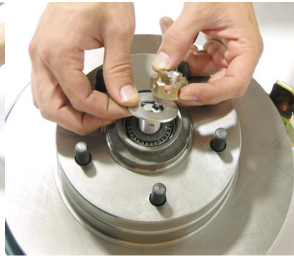
Outer Bearing Assembly

Turn the rotor face up and grease the bearing race. Pack the smaller bearing (Outer) and place it in the rotor. Slide the rotor onto the spindle being careful that the outer bearing does not fall out of place. Install the keyed washer and castle nut and torque to the specifications provided in the factory assembly manual. Fix it in place with the new cotter pin supplied with your kit. Install the dust cap with a mallet and a large socket placed over the dust cap. A screwdriver can also be used along the edges.