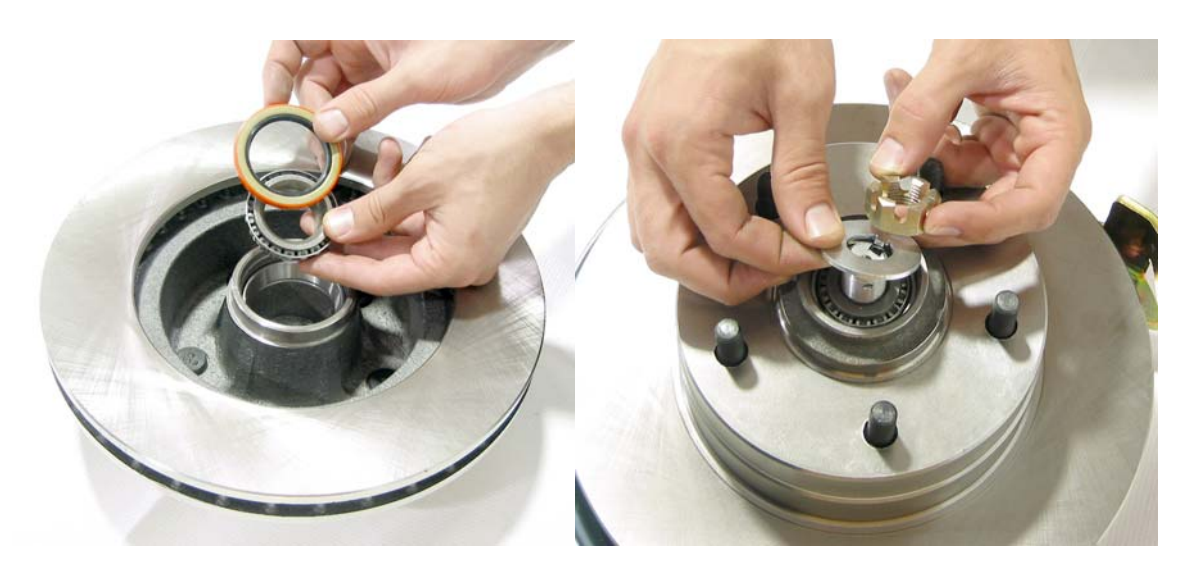
Inner Bearing Assembly

You are now ready to install the bearings and rotor. Start by placing the rotor face down. Races come preinstalled in the rotors. If you received additional races with your bearings, they will not be used. Inspect the bearing area for casting sand and other debris before installing the bearings. Apply a little bearing grease to the bearing race already in the rotor and pack the larger of the two bearings (Inner) with grease. Install the bearing into the rotor and place the grease seal on the rotor. Tap the seal into place being careful not to damage the rubber portion of the seal. A small block of wood works well to protect the seal.