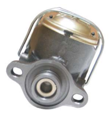
Deep Pocket Illustration

Note : Make certain that you have a deep pocket master cylinder. Make absolutely certain there is no plug in the back of the master cylinder and that you have a hole approximately 1" to 1 1/4" deep in the back of the master. See picture below.