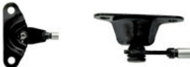
Top View Side View Swivel Eyelet