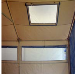
Roll Up Velcro Windows