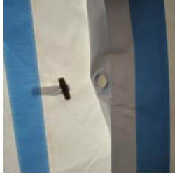
Includes Door Hold-Ups