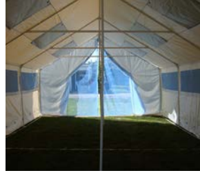
Removable Center Structural Support