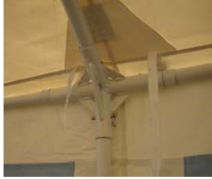
All frame members are long life Structural Steel