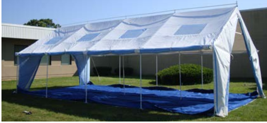
Sides Can Roll Up To Create A Canopy Or Medical Facility