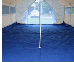
Rubber-Backed Fabric Floor Kit Included