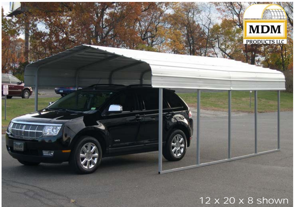
12 x 20 x 8 shown