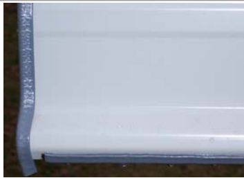
Easily applied edge coping provides a finished edge