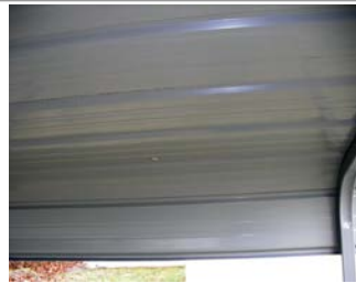
Weather resistant all-steel roof