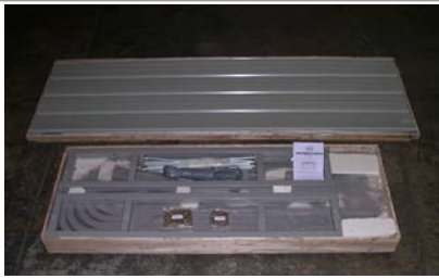
Ships in all wood crates