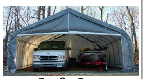
Two Car Garages