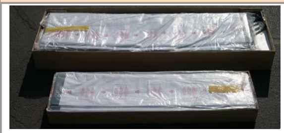
Consumer friendly packaging -Easy to handle 2 box shipment