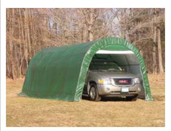
One Car Garages