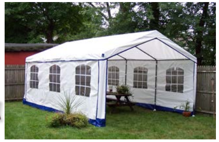
Spec 1ExtH 06/07