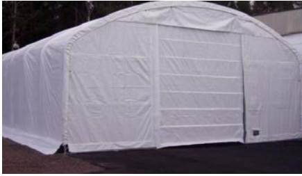
Easy Roll-Up Mechanical Door On Each End