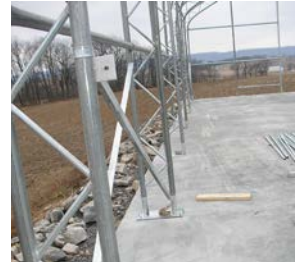
Heavy-Duty Base Plates