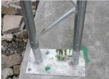
Side Tensioning Cover Ratchet