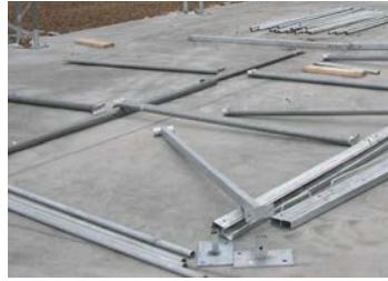
All frame members are long life galvanized steel