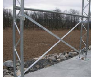
Structural wind brace on each corner