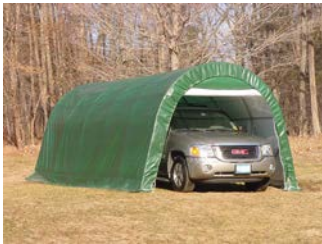
One Car Garages