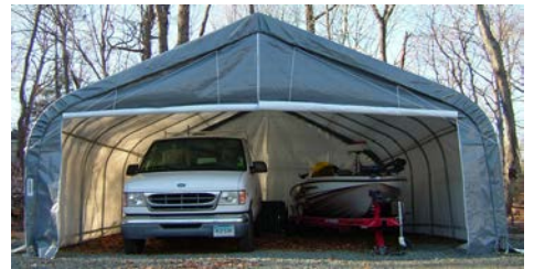
Two Car Garages