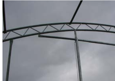
Pre-Drilled, Bolt together frame