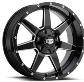
875 REV 875 Patent Pending

Finishes: Gloss Black w/Machined Face, Gloss Black & Milled, Gloss Black Sizes: 17x9, 20x9 - 5 and 6 lug