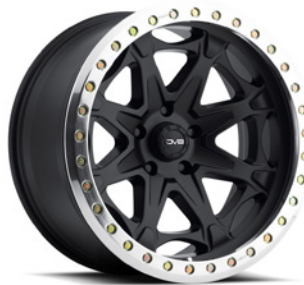
886 REV 886

Finishes: Gloss Black with Machined Ring, Bronze with Anthracite Ring Sizes: 17x9, 20x9, 20x12 - 5, 6 and 8 lug