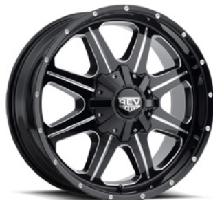
823 REV 823 Patent Pending

Finishes: Matte Black w/Milling Sizes: 17x9, 20x9 - 5, 6 and 8 lug