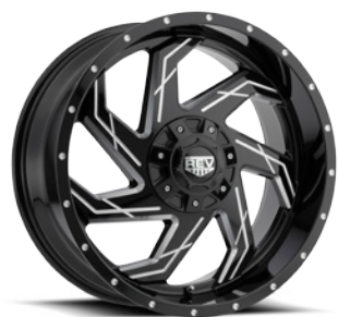
895 REV895 Patent Pending

Finishes: Matte Black w/ Polished Ring Sizes: 15x7