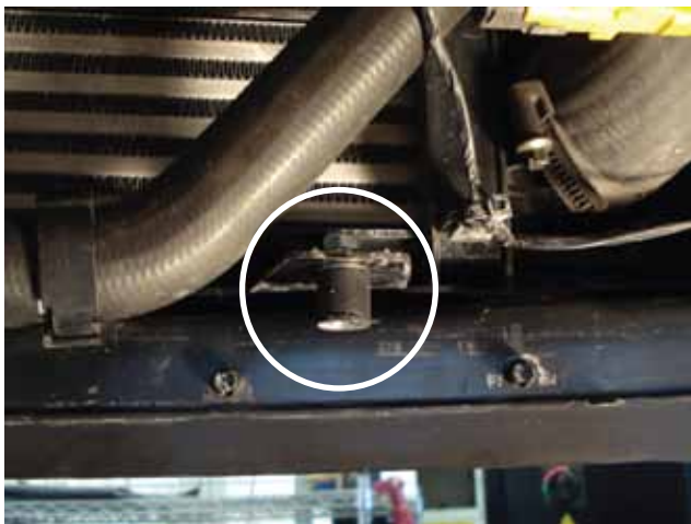
Step 3 - Install the (2) rubber standoffs as shown above. Using the supplied nuts and washer.