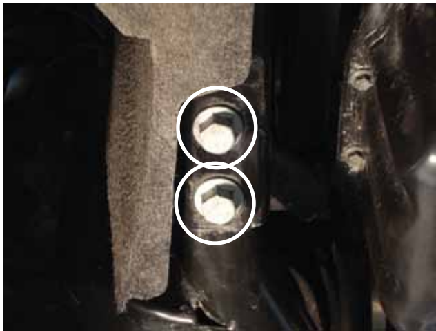
Step 2 - Remove the (2) Subframe bolts on each side of the car and install the skid plate brackets as shown above. Note: Work on one side of the car at a time.