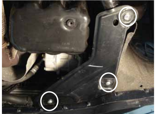
Step 1 - Remove the (2) plastic covers as shown above. These will not be reused.