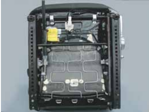
Step 1 - Remove drivers seat from car and position it so you can access seat bottom as shown.