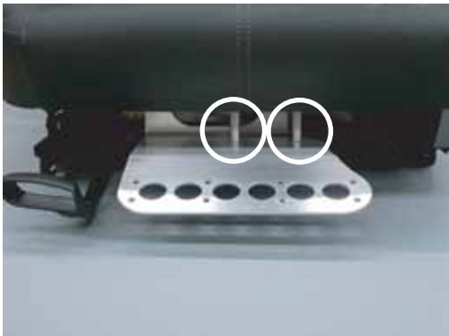
Step 6 - Tighten all bolts.