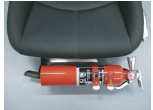
Step 8- Install seat back into car and attach fire extinguisher.