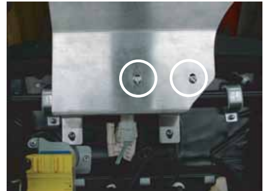
Step 5 - Install the 2 front mounting points using the supplied spacers, 2.25" socket head cap screws and washers. See step 6 for spacer placement.