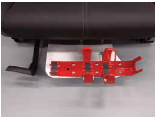
Step 7 - Install fire extinguisher bracket using the supplied (6) 10/32 button head screws, washers and nuts. This mount was designed for a standard Hal Guard bracket. If your mounting holes are different you may need to drill your bracket to properly fit. Note: Bracket placement and orientation will vary for power and manual seats.