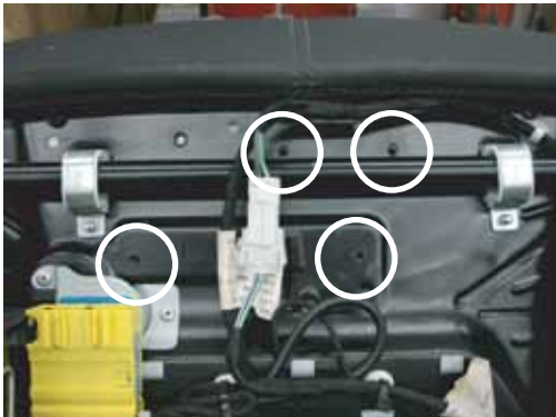
Step 3 - Align bracket with these (4) holes. A small screw driver or punch will help you to position bracket.