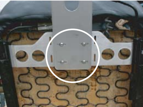
Step 8 - Adjust the fire extinguisher to the desired location and tighten the 4 button head screws that were installed in step 3.