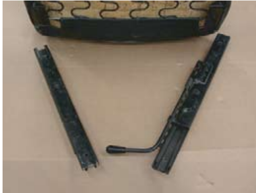
Step 2 - Remove seat rails.