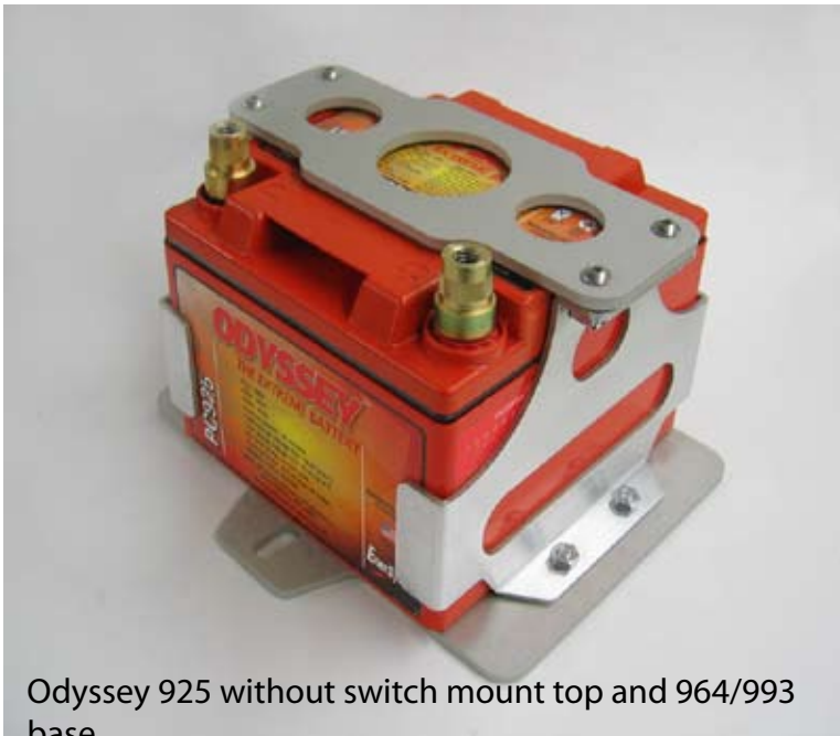
Odyssey 925 without switch mount top and 964/993 base

8. Mount unit into car using the factory battery mounting bolt.