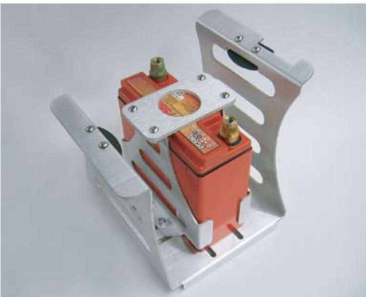
Odyssey 680 with smugglers box relocation cradle EL 34,35,37,38