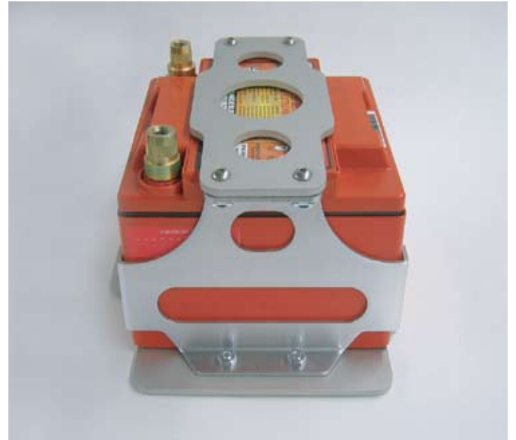
Odyssey 925 without switch mount top and 911/996