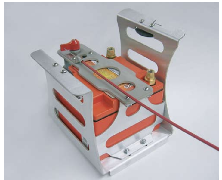
Odyssey 925 with smugglers box relocation cradle

Learn more about performance starting & charging we have.