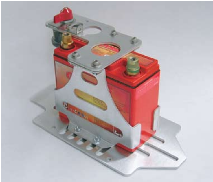
Odyssey 680 with switch mount top and 911/996

Here are a few photos of different configurations.