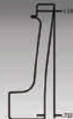
C1-SL-Curve-F Curve Concave C1F Lathe Blank