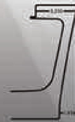
C3-SL-F Curve X-Concave SL-F Lathe Blank