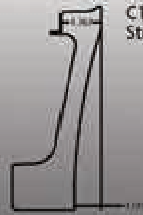
C1-HL-R Straight Concave R Lathe Blank