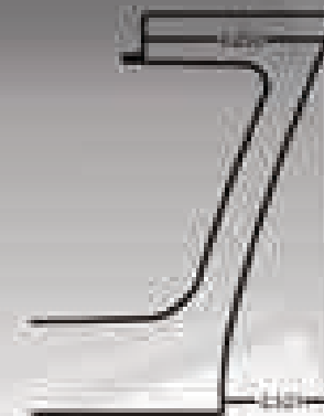
C4-SL-R Curve X-Concave SL-R Lathe Blank