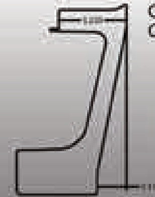
C3-HL-F Curve X-Concave HL-F Lathe Blank