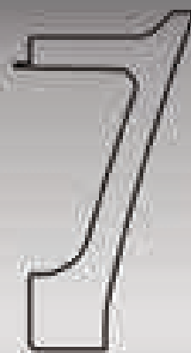
C4 Straight Angle X-Concave Step Lip