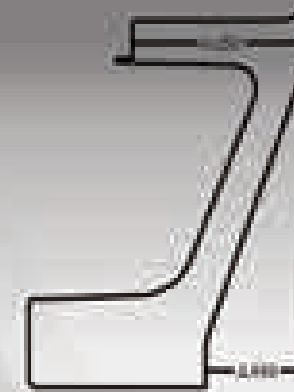
C4-HL-R Curve X-Concave HL-R Lathe Blank