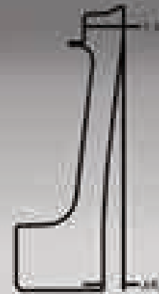
C1-HL-F Straight Concave F Lathe Blank