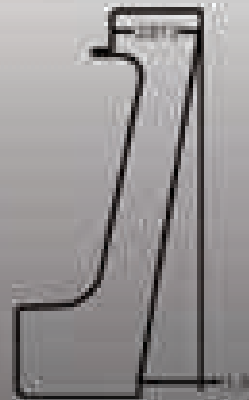
C1-SL-Curve-R Curve Concave C1R Lathe Blank