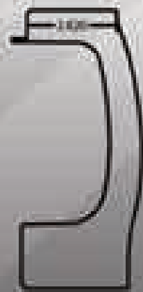
S1 Curve X-Lip Forging