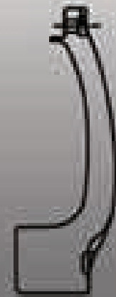
F1 Standard Flat Lathe Blank