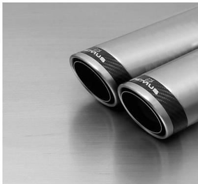
#84CS: tail pipe Ø 84 mm Carbon Race, polished