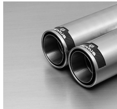
#84C: tail pipe Ø 84 mm Street Race, polished