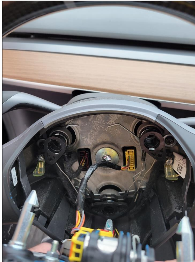
(Reference image of internals of steering wheel core with connectors still connected)