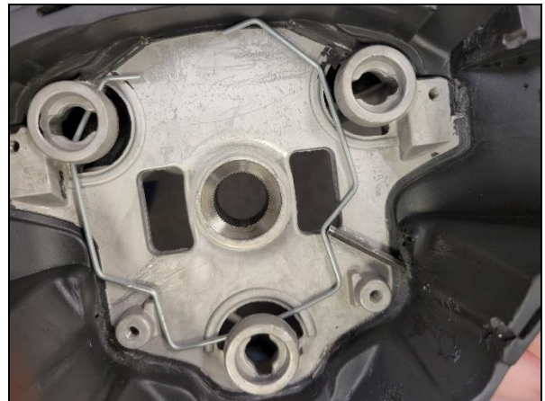
(Internal view of the formed wire being released inside of steering wheel)