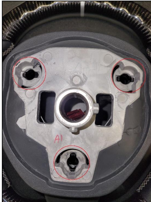
(Referenced image showing back of steering wheel core and location of tabs to be removed from locked position)