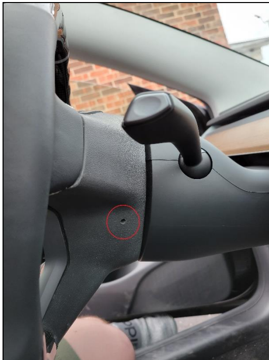
(Referenced hole on either side of steering wheel)