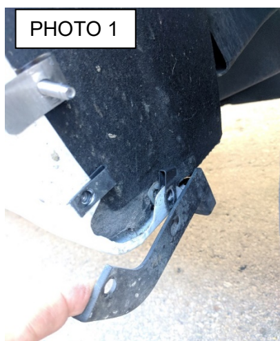
WITHOUT FENDER FLARE