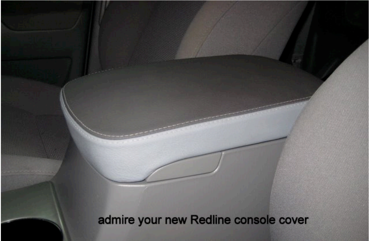
admire your new Redline console cover