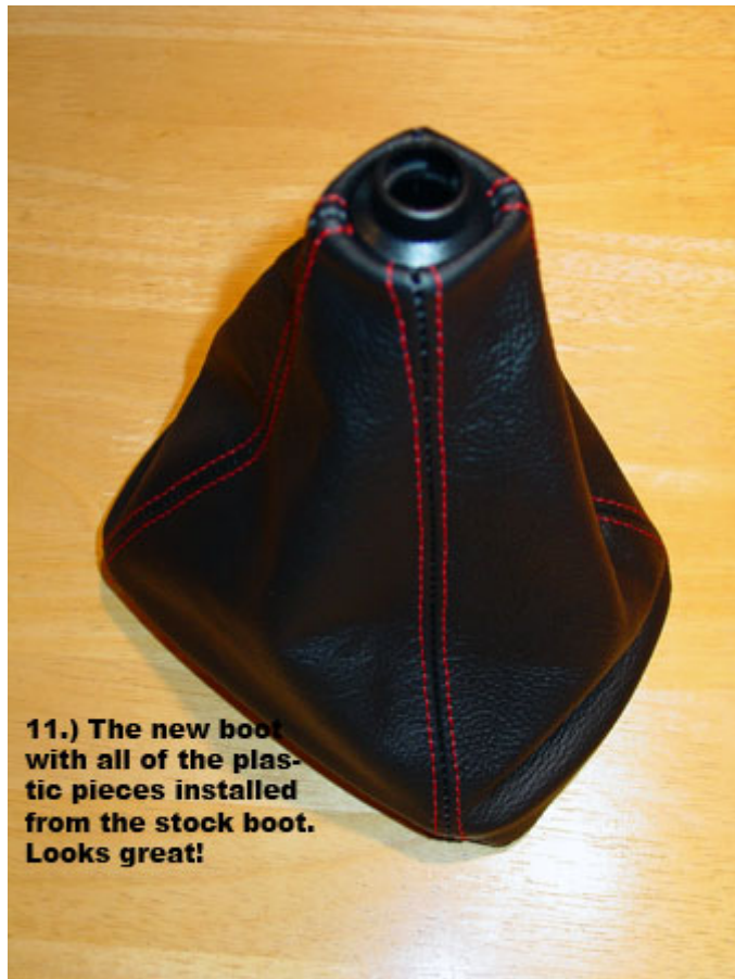
11.) The new boot with all of the plastic pieces installed from the stock boot. Looks great!