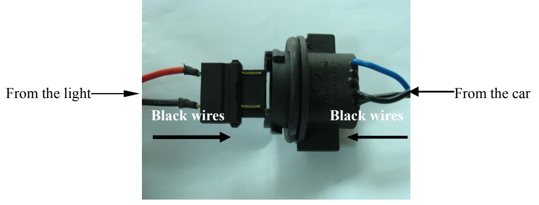
Pic. 2. The wire harness for the Turn Signal Function

Please follow the directions and color of the wires (shown in Pic. 2). Connect the connector with the corresponding wire color. (black wire goes in-line with black wire)