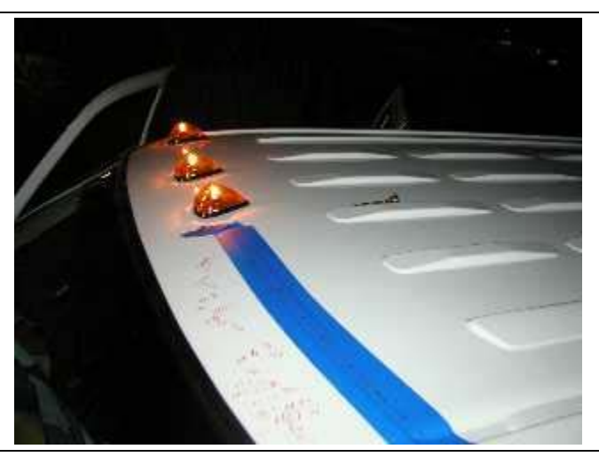
The last thing to do is pop the harness rivets back in place, put the headliner back up, visors, pillars and final clean up. And getting all the grease pencil markings off the roof!

Here's where everyone gets excited and just has to put the lights in as they proceed and give them a try. Three down, two more to go!