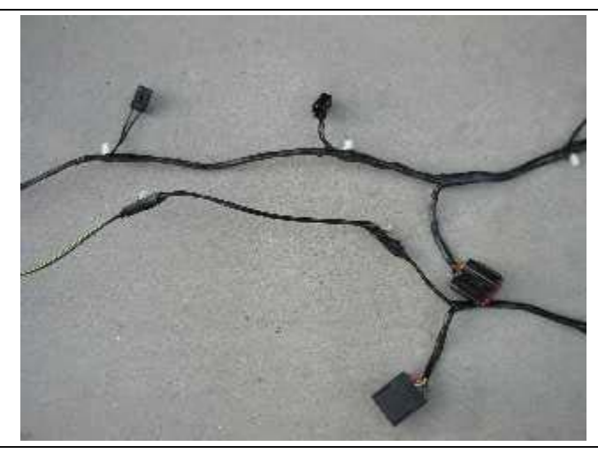
Here's a good comparison of the wiring harnesses. You see the additional nodes on the right picture. Those are for the clearance lights. You will have to remove the passenger kick panel and really fight the plastic rivets behind the glove compartment. They will finally give up the fight. You do not have to re-rivet the portion of the wiring harness that runs down the kick panel. It can be very difficult to get your hands in there.