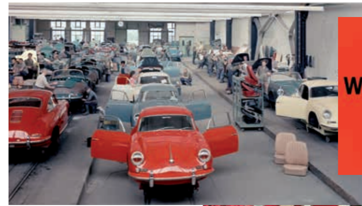
Our first ads under a new name.

Did you know that in 1950, the body and interior of the first Porsche 356 sports car was built at the first Reutter plant? In 1963, Reutter sold its second bodywork plant in Stuttgart's Zuffenhausen district to Porsche, and began focusing on its core business of seating under a new name – RECARO.