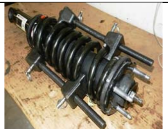
Mark the back side of the strut (frame side), on the top and bottom for aid in reinstallation alignment. Use a strut spring compressor to compress the spring. Caution: The spring is under high pressure and can cause injury or 12. death if not handled properly.