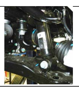
Remove the spring compressor. Install the top of the strut first using the supplied silver 10mm x 1.25 nuts and a 14mm wrench. Leave the nuts loose. Install the lower strut to the lower control arm using the factory bolt and a 21mm socket. Torque top nuts.