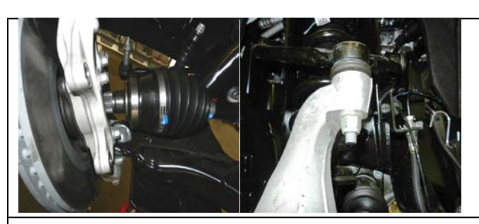
Reinstall the axle into the steering knuckle. Reinstall the upper control arm to the steering knuckle. Torque down using a 18mm socket. Install the factory hardware to the axle and tighten down with a 36mm socket. 17.