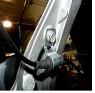
Remove the ABS line from the knuckle using a T30 torx socket and a 10mm socket.