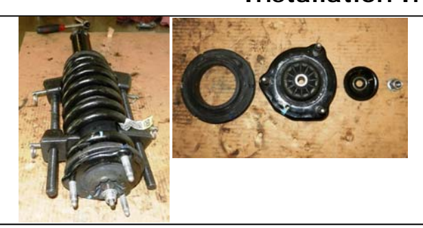
Once spring tension is off of the nut, remove the spring hat with a 15mm (nut) and 6mm wrench (shaft end). Remove the top hat and rubber isolator.