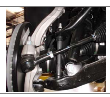
Reinstall the tie-rod using a 21mm socket. Reinstall the sway bar end links using a 13mm socket for the bottom and a 15mm socket for the top. 20.