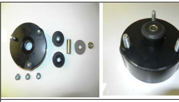
Install the rubber bushings to each side of the spacer. Lube the metal sleeve and press into the bushings. 14.