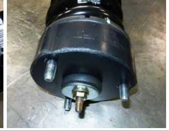
Install the rubber isolator and ReadyLIFT top hat spacer onto the strut using a supplied washer and gold 10mm x 1.5 flange nut. Use a 15mm and 6mm wrench. Make sure to line up the markings from top to bottom on the strut. Do not use an impact gun, tighten down by hand.