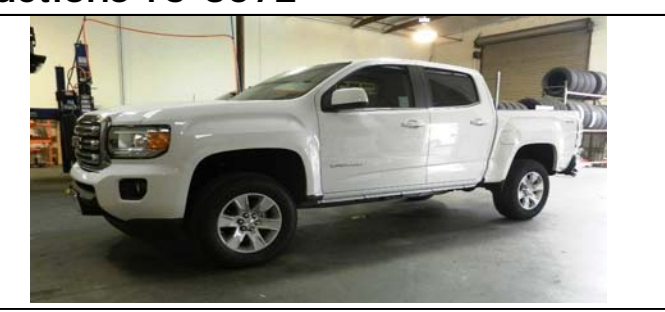
Recheck all work performed to ensure proper installation of the kit. Have the vehicle aligned immediately after kit installation.

Reinstall the wheels using a 22mm socket, lower the vehicle to the ground and torque the lug nuts to 100 ft lbs. Tighten down the lower control arm bolts using a 24mm socket if loosened.