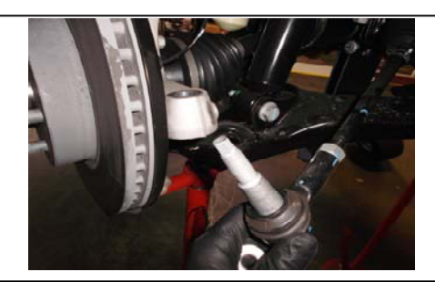
Remove the tie rod ends from the steering knuckle using a 21mm socket. Note: You may need to use a hammer to separate the ball joint from the knuckle.