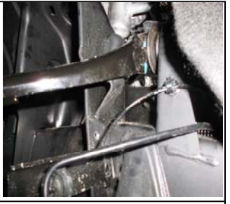
Loosen the upper control arm using a 13/16" socket and wrench. Let it rest on the droop stop, then retighten the upper control arm and torque it down to 90ft lbs. Loosening the lower control arms may be needed as well.