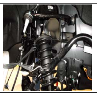
DO NOT over extend the cv-axle joints, doing so will damage/ break them. Lift the sway bar out of the way, then remove the strut from vehicle. 10.