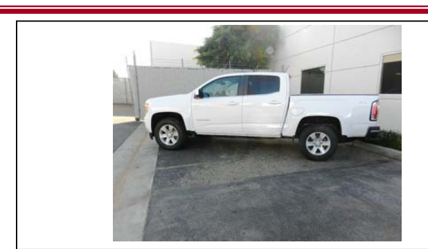
Put the vehicle onto level ground. Measure from the ground to the center of the fender well at all four wheels. Record the data in 1. the space provided on page 2.

The Bill of Materials represents the component contents of this kit. All hardware is of the highest grade and the components are manufactured to exacting specifications for a trouble free installation. Use the attached torque specifications chart when final tightening of the nut and bolts are done.