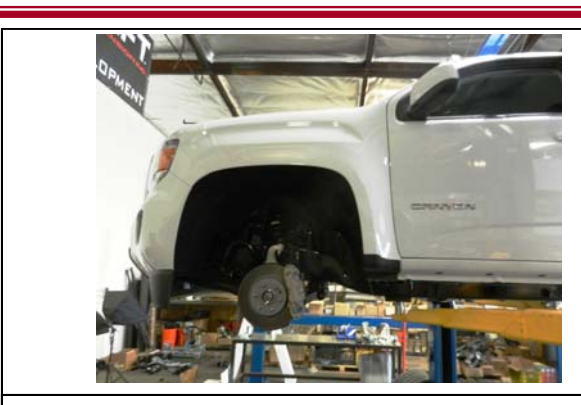
Lift the vehicle by the frame. Then remove the wheels using a 22mm socket.