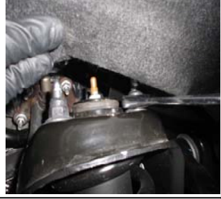
Loosen the lower control arms at the frame using a 24mm socket. Unbolt the strut from the lower control arm using a 21mm socket, then unbolt the 9. top of the strut using a 18mm wrench.