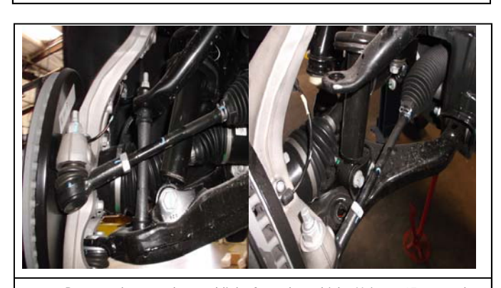
Remove the sway bar end links from the vehicle. Using a 15mm socket on top and a 13 mm socket on bottom.

3. Loosen the factory sway bar at the frame using a 10mm socket.