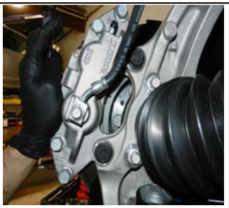
Unbolt the axle nut using a 36mm socket. Use a soft mallet or press tool to knock the axle from the knuckle. Remove the brake calipers from the 7. knuckle using a 18mm socket. Hang out of the way.