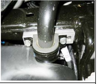
Install the sway bar offset spacers to the frame using the factory 10mm bolts. Install the sway bar to the offset spacer using the provided 10mm x 1.5 x 20mm bolts and a 14mm socket. 19.