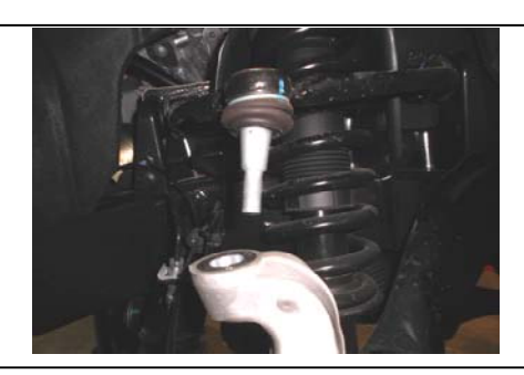
Separate the upper control arm from the steering knuckle using an 18mm socket. Note: the upper control arm will be under tension.