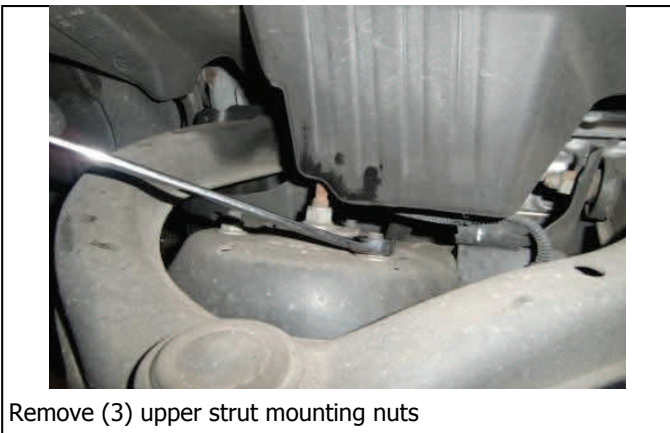
Remove (3) upper strut mounting nuts