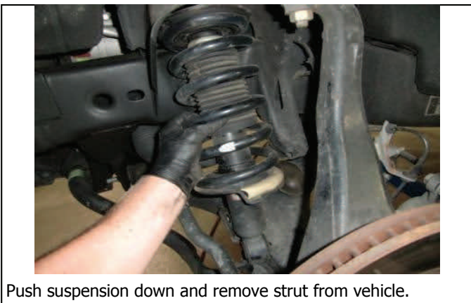
Push suspension down and remove strut from vehicle.