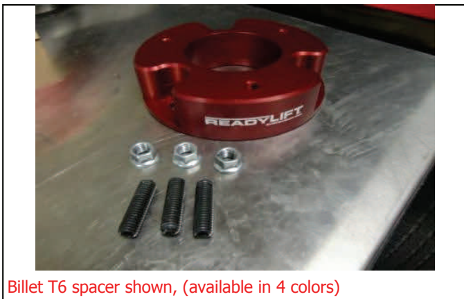
Billet T6 spacer shown, (available in 4 colors)