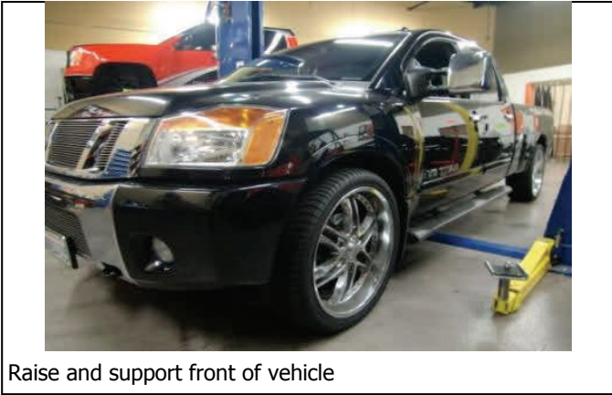
Raise and support front of vehicle