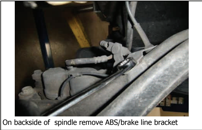
On backside of spindle remove ABS/brake line bracket