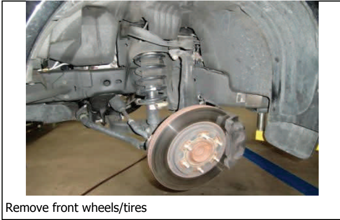
Remove front wheels/tires