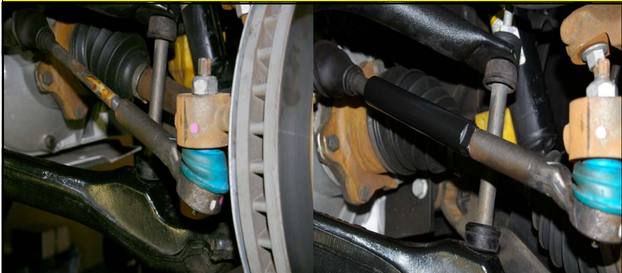
Before ReadyLift® Tie Rod Support Kit

*It is also recommended that you adjust your headlights whenever your vehicle's ride height is altered.