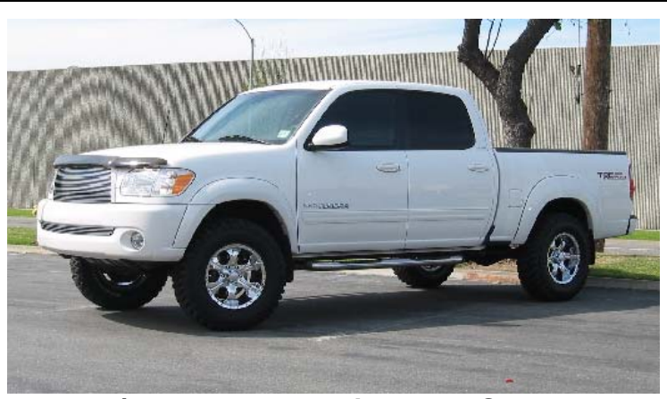
285/70R17 on 17x8 with 4.5" BS shown

*Adjust your headlights whenever your vehicle's ride height is altered.