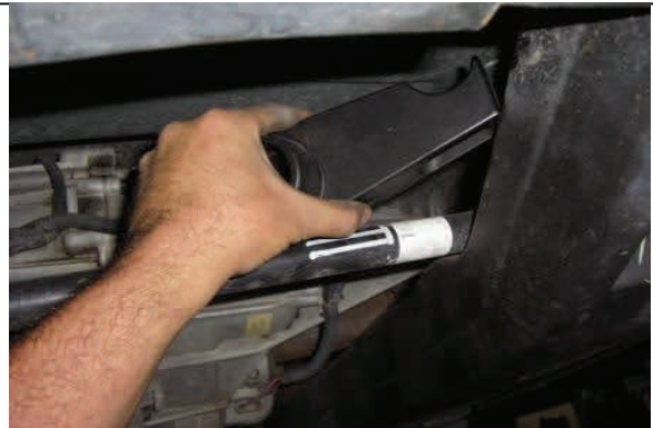
Install new ReadyLIFT forged torsion key