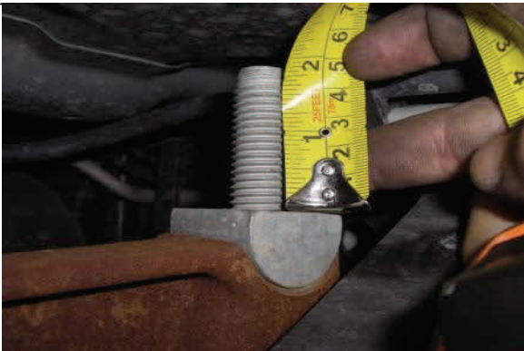
Measure threads on top of torsion bar adjusting block