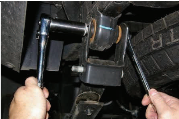
Support axle and disconnect/remove shackles and hardware.