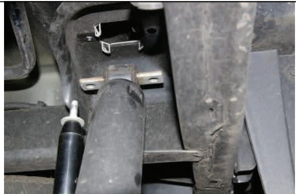
Disconnect upper shock mounting bolts