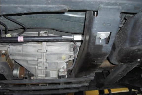
Raise and support vehicle on jack stands, locate torsion bars