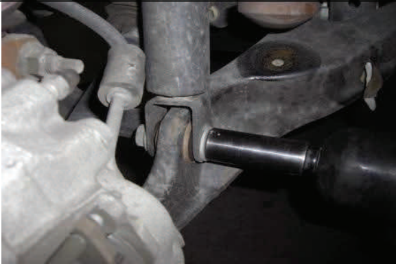
Remove lower shock mounting bolt/nut