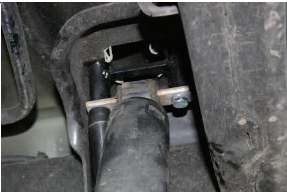
Install upper shock extensions and new hardware.

Reinstall wheels/tires and torque to spec. Re-check all work performed and torque all hardware to spec. Test drive and have vehicle aligned.