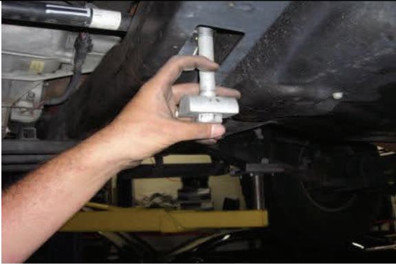
Reinstall adjustment bolt and block to original measurements

Note: Torsion bars can be adjusted to the initial thread measurements on the adjusting bolts. Once the rear parts are installed and with the vehicle on the ground the necessary adjustments can be made and finalized by the alignment shop.