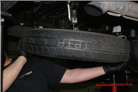
Remove spare tire in order to remove shackle bolts