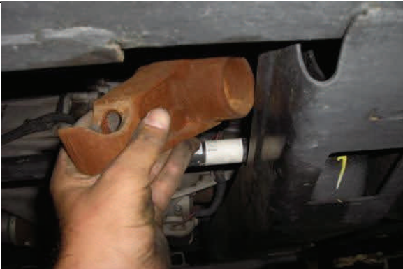
Remove OE torsion key