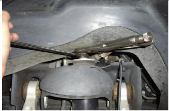
Remove upper shock mounting hardware