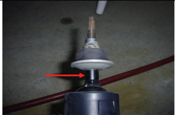
Install spacer underneath bottom shock bushings