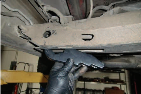
Install new ReadyLIFT forged torsion key in same position.