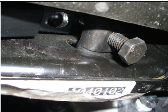
Install new adj. bolt and make bolt flush with cross-member