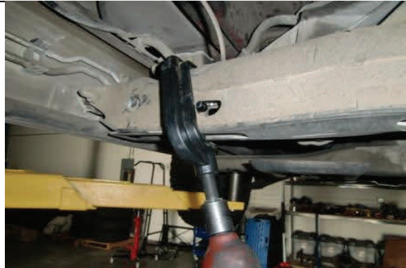
Reinstall tool and adjust upward enough to insert adj. block