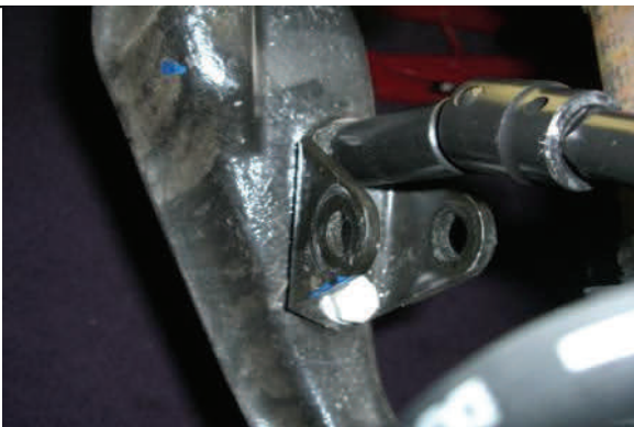
66-3050 shock extensions will replace the OE brackets