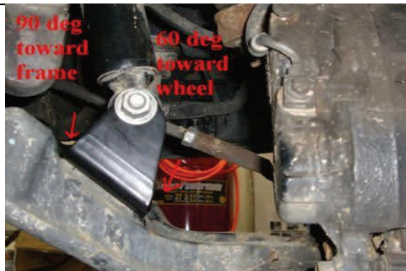
Install new extension bracket with OE bolts as shown

Reinstall wheels/tires and torque. Recheck all work performed and test drive vehicle. Note: Initial height can now be set. Final adjustments of the torsion bars may, and should be performed by the alignment shop.