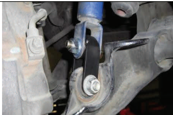
66-3000 Install front lower shock extensions and hardware