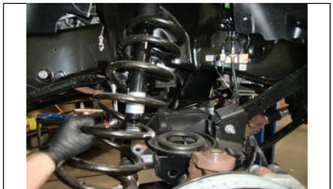
Remove spring towards the front of the vehicle.