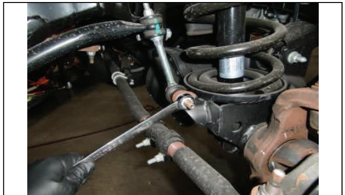
Disconnect pass/dr lower sway bar endlinks.