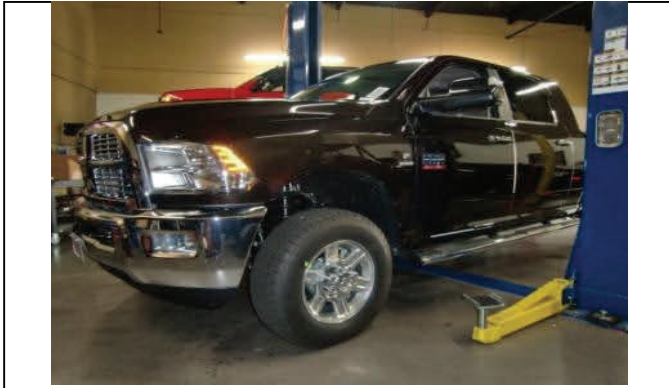
Raise and support front of vehicle on level ground.