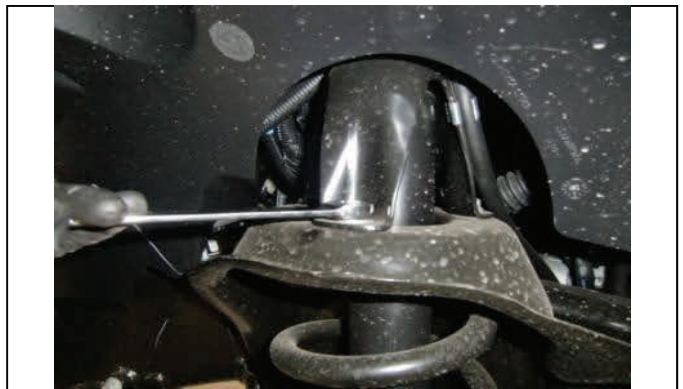
Loosen all (3) upper shock tower mounting nuts. Leave on.