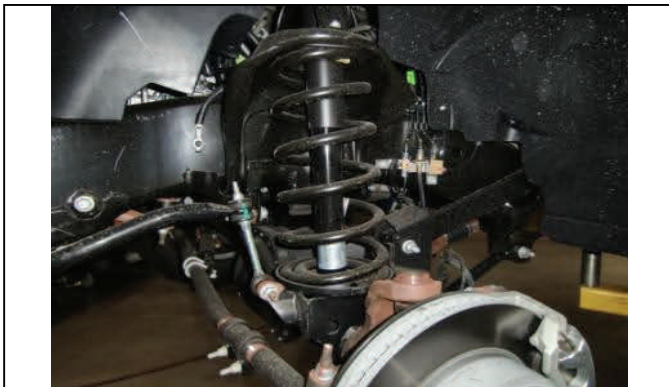
Picture of front suspension. Support front axle with jack.