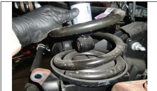
Slowly lower axle in order to remove shock and coil spring.