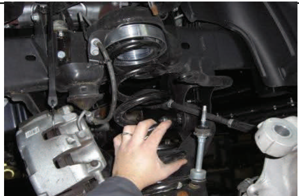
Reinstall coil spring and properly clock in lower control arm.