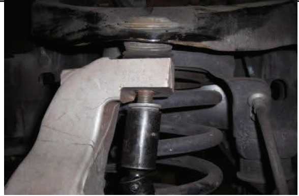
Loosen upper ball joint nut and break loose with hammer.

Break loose tie rod/upper ball joint No photo