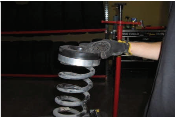
Remove upper isolator and replace with new ReadyLIFT hat.