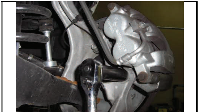
Remove brake calipers