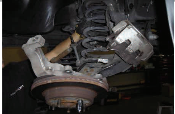
Slowly lower suspension and remove coil spring.