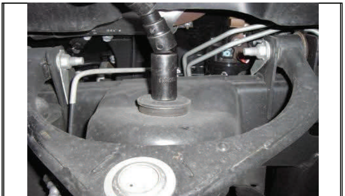
Disconnect upper shock mount and bushing