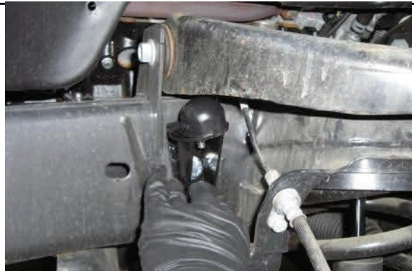
Note: pass/dr side brackets are specific. Tighten once aligned