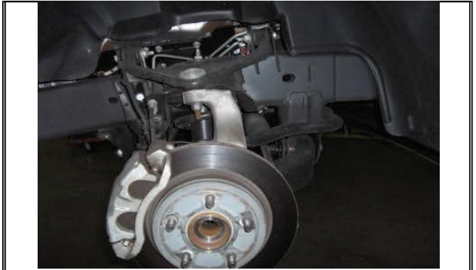
Remove front wheels and tires