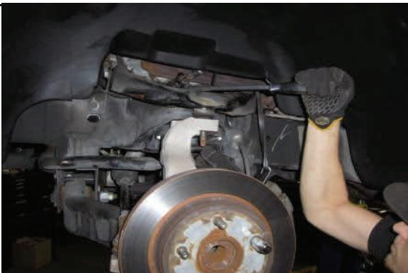
Carefully lift suspension enough to engage upper ball joint.