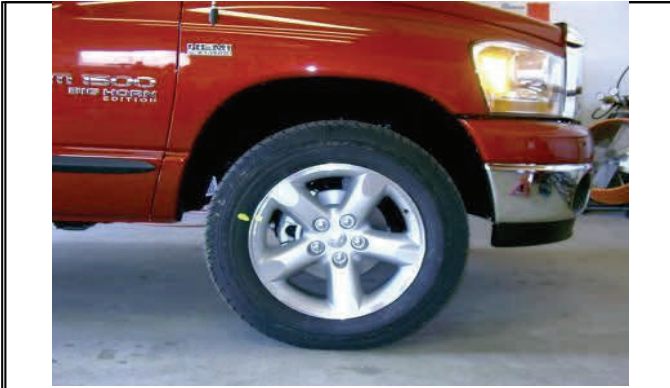
Place vehicle on level ground, properly lift and support.