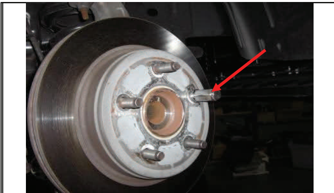
Place a lug nut back onto any wheel stud as shown