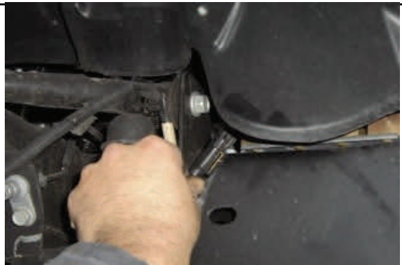
Reconnect ABS lines.

Torque all hardware to factory spec and recheck to ensure there is proper clearance and slack for ABS lines to travel through entire suspension range. Reinstall and torque wheels and tires, test drive and have vehicle aligned.