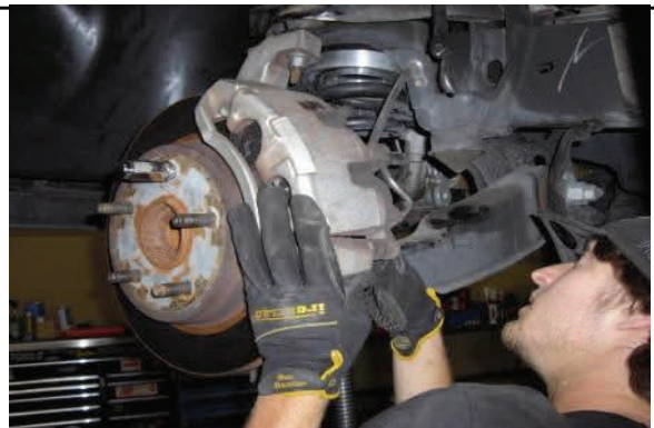
Reconnect brake calipers, sway bar end links, and tie rods.