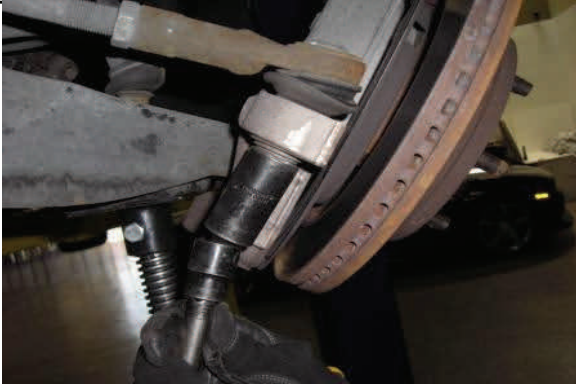
Disconnect tie rod end nut and break loose with hammer