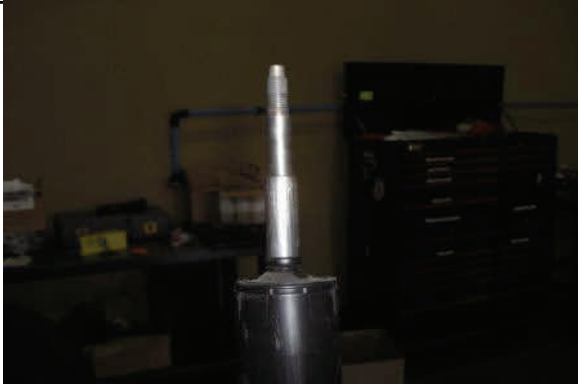
Install and tighten new upper shock extension