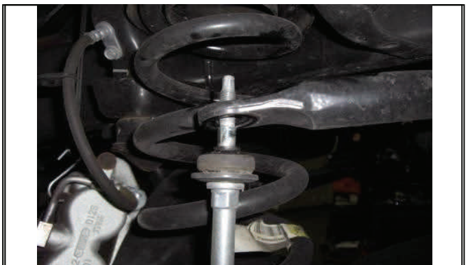
Disconnect upper sway bar end links and bushings