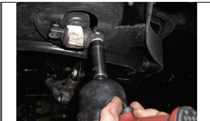
Disconnect lower shock mounting bolts.