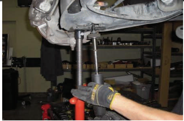
Reuse OE bushings and hardware top and bottom.