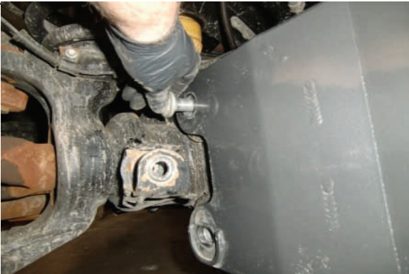
Install new assembled radius arm w/ OE bolts at top