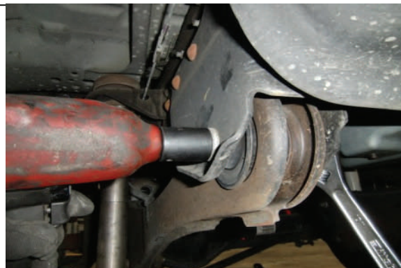
Loosen and remove bolts at rear of dr./pass. radius arms