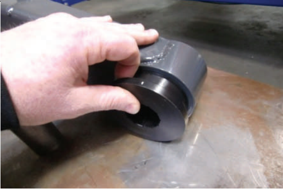
Use assembly lube to install urethane bushings