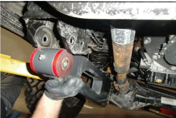
Raise radius arm into frame, attach w/ OE hardware