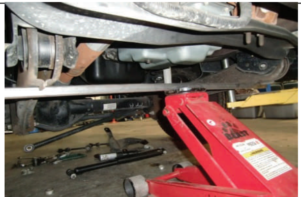
Block front wheels, use a jack w/crossbar to support arms