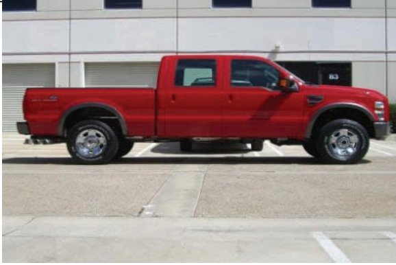
Place vehicle on level ground Leave wheels/tires on vehicle