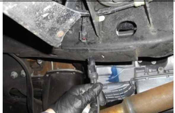
Disconnect ABS line at plug above radius arms