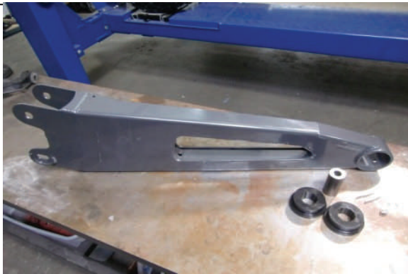
Photo shows one side Stage 2 radius arm and bushing kit