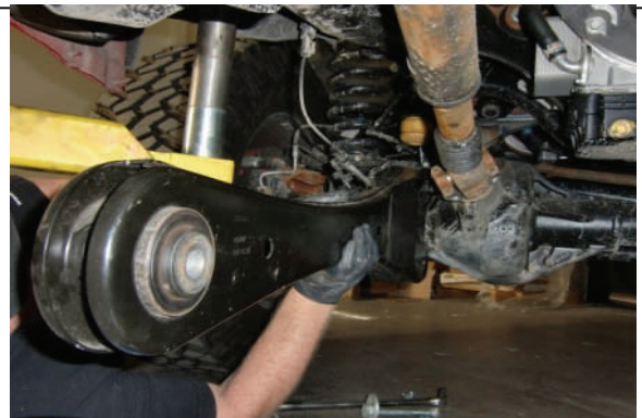
Lower slowly & remove front radius arm hardware and arms