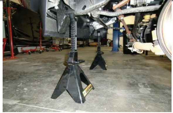
Support weight of the vehicle by frame. Min. 3 ton jacks