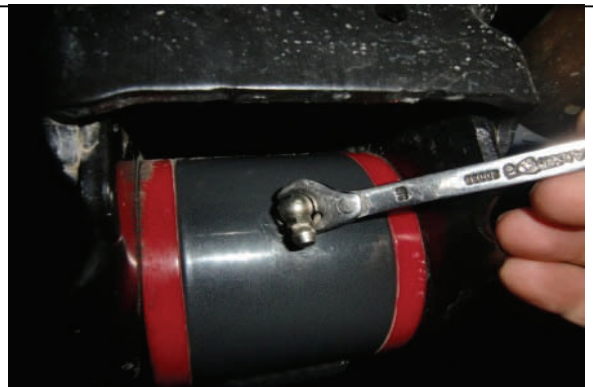
Install provided zerk fittings and reconnect ABS/vacuum lines

Lower vehicle onto it's own weight and torque radius arms hardware to spec and set alignment cams to neutral position. Test drive and have vehicle aligned.