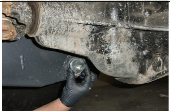
Install new offset cams/bolts/nuts into front lower mount