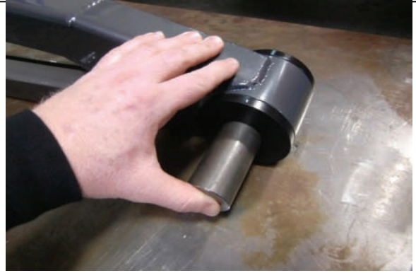
Lube pivot pin and install into bushings