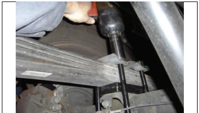
Raise axle, install new u-bolts and hardware, tighten.

Reconnect shock and lower vehicle to ground and torque u-bolts to factory specs. Test drive and check all work performed.