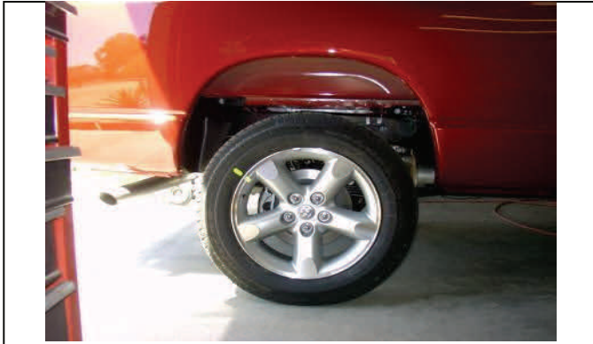
Raise and support rear frame of vehicle on level ground