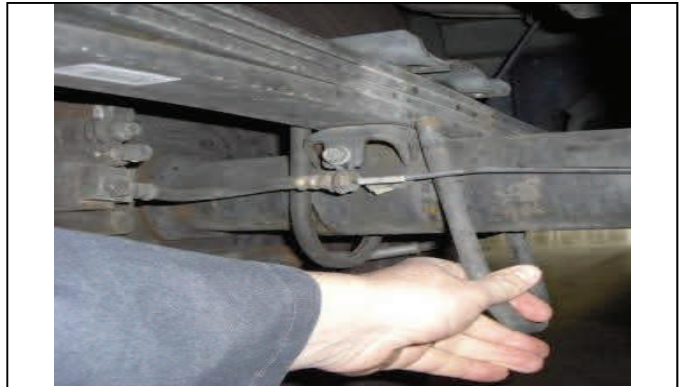
Remove u-bolts and carefully lower axle.