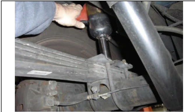
Work on one side of vehicle at a time, remove rear u-bolts.