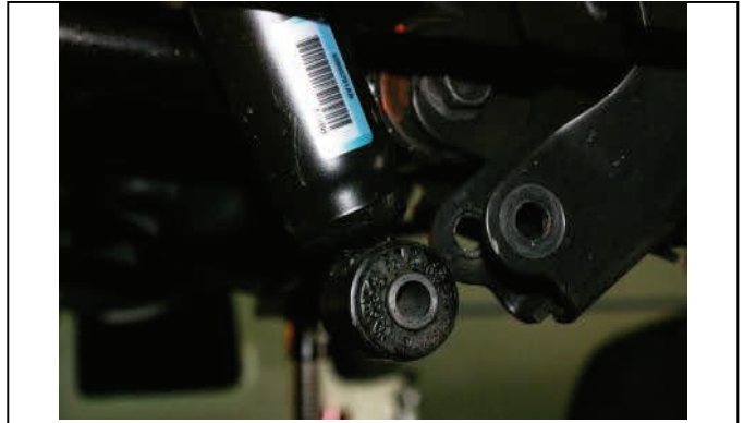
Disconnect rear lower shock from axle mount.