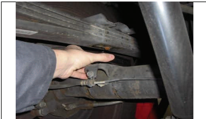
Center lift block on axle pad under leaf spring pin side down.