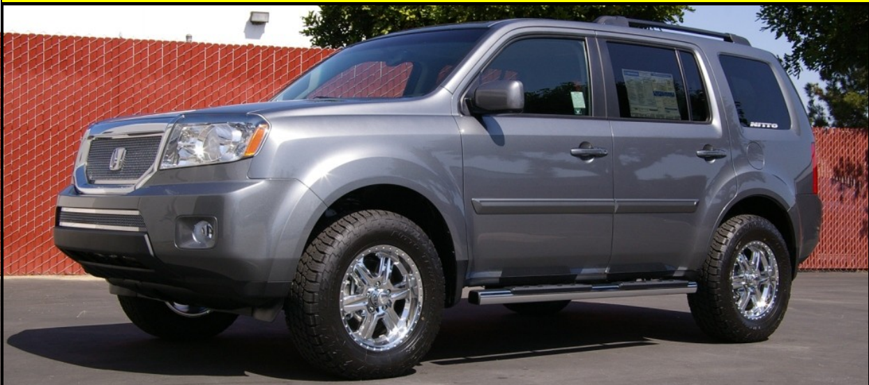
After ReadyLift® 69-8020 SST Lift kit. 265/65R17 Nitto Terra Grapplers on 17x8.5 +30 offset AR Fuel. Minor trimming needed.

*It is also recommended that you adjust your headlights whenever your vehicle's ride height is altered.