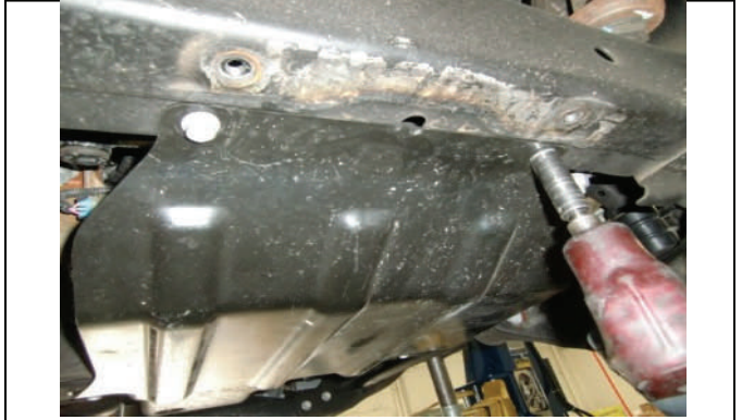
Reinstall front skid plate