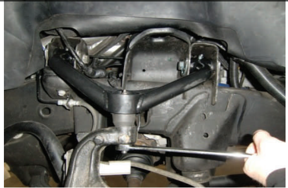
Connect upper ball joint to spindle