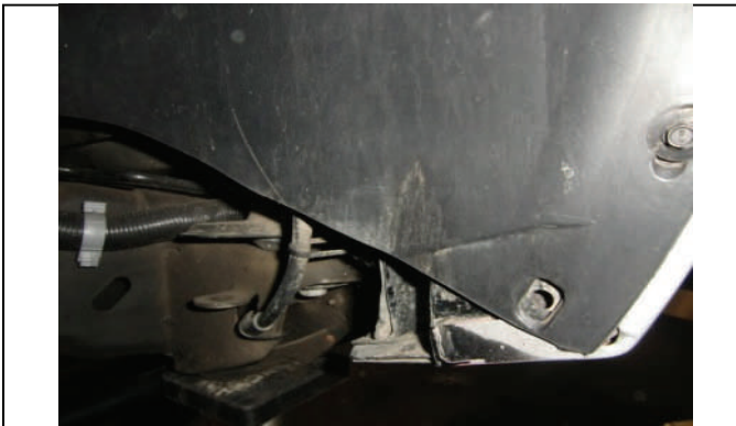
Slight/moderate trimming may be necessary for tire clearance

Once you have tightened all hardware and reinstalled and torqued the wheels/tires, it is now necessary to adjust the torsion bar keys to the desired height, ( Not to exceed 3.25 in. on 4WD models, up to 4.0 in. on 2WD models ). When adjusting the torsion keys, make sure to take pressure off of the suspension in order to avoid damaging the adjusting bolts. The vehicle will also need to be aligned and final adjustments may be required in order to properly align. Align vehicle to factory specs and be sure to readjust the headlamps as well. Failure to adhere to these specifications will void the ReadyLIFT warranty!