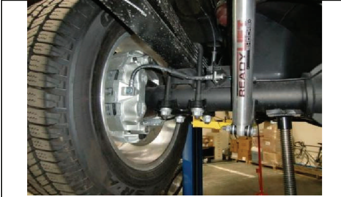
Properly support rear axle and disconnect lower shock mount