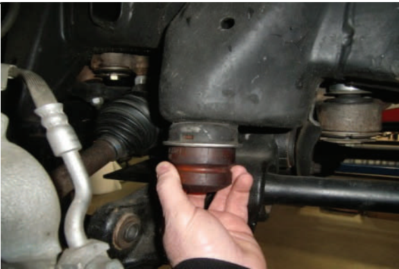
Remove factory lower control arm bump stops (4)