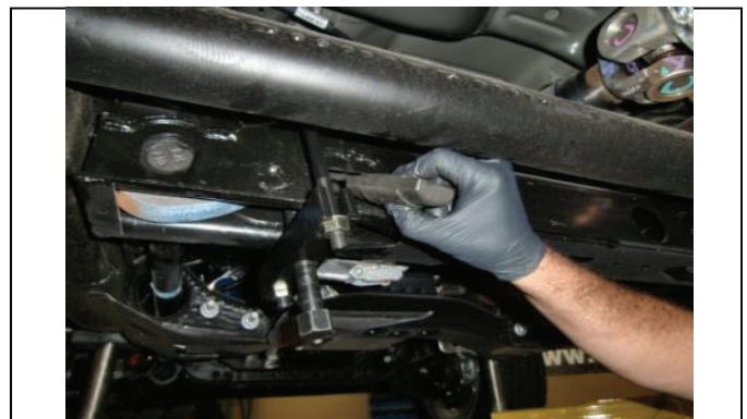
Adjust tool just enough to remove keeper block