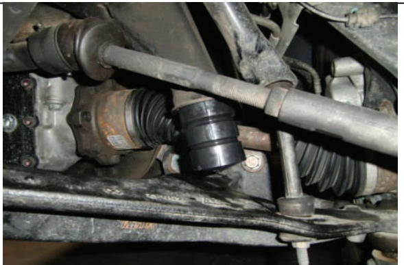
Install new provided bump stops (4) in OE locations