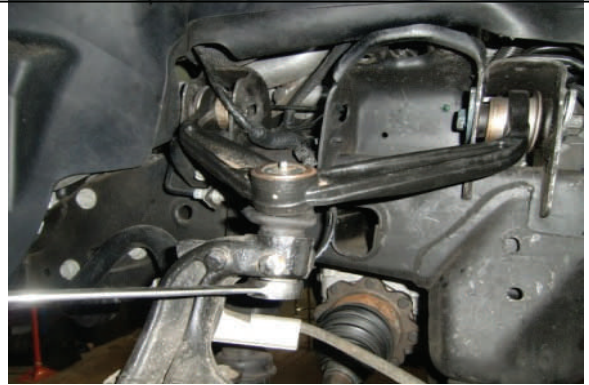
Loosen and remove upper ball joint nut.