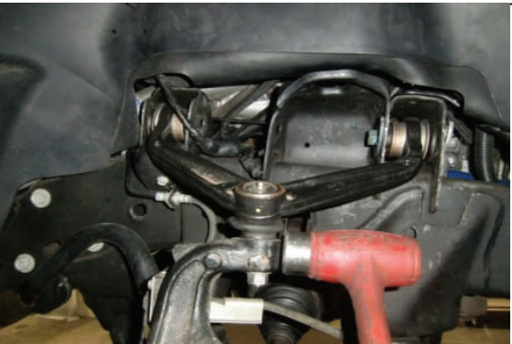
Strike spindle to disconnect ball joint from upper control arm