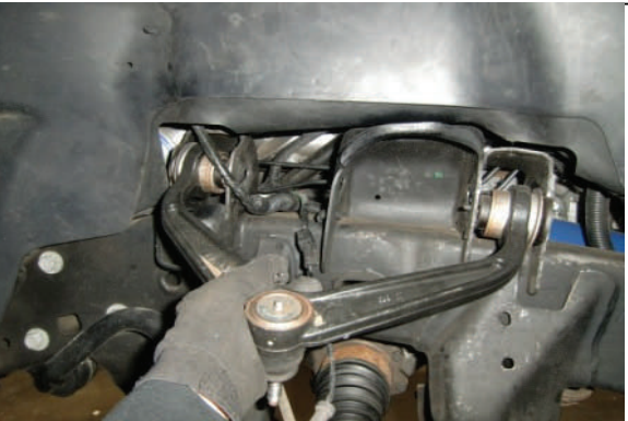
Remove upper control arm from frame pockets