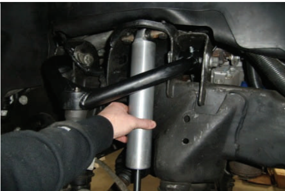
Longer shock are required for this kit, use RL #99-3414F