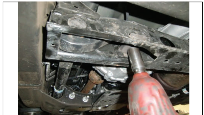
Remove torsion bar adjuster bolt. It will be reused.