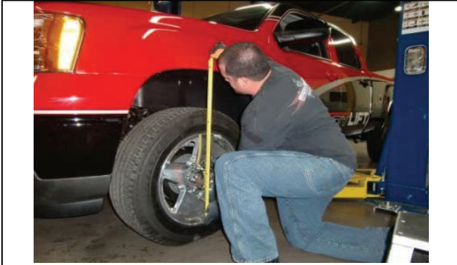
Measure ride height then lift vehicle and remove wheels/tires.