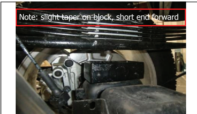
Locate lift block on axle mount and raise to meet leaf spring