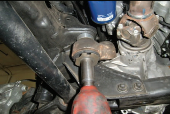
Install (4) differential drop spacers with new hardware