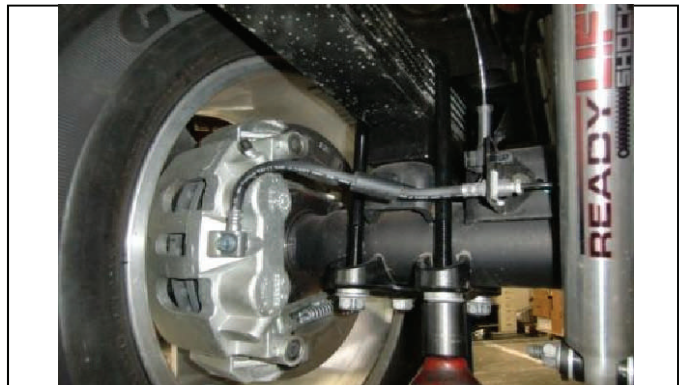
Torque u-bolts with vehicle on ground and re-clip ABS wire