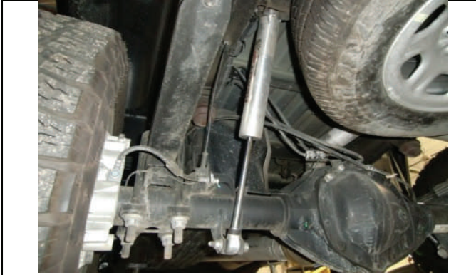
Longer shocks recommended for this kit use RL# 69-3411R