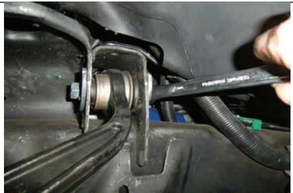
Loosen and remove pivot bolts and cams; they are very tight.