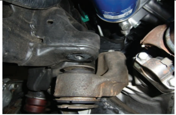
Remove (4) diff mounting bolts at frame, lower differential.