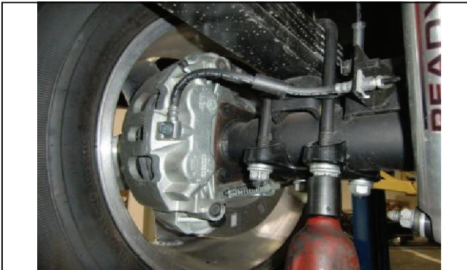
Loosen and remove u-bolt hardware