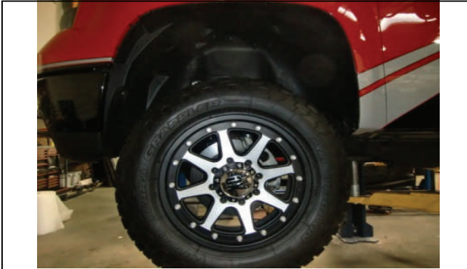
Install wheels/tires lower vehicle to ground check clearances

Once you have tightened all hardware and reinstalled and torqued the wheels/tires, it is now necessary to adjust the torsion bar keys to the desired height, ( Not to exceed 3.25 in. on 4WD models, up to 4.0 in. on 2WD models ). When adjusting the torsion keys, make sure to take pressure off of the suspension in order to avoid damaging the adjusting bolts. The vehicle will also need to be aligned and final adjustments may be required in order to properly align. Align vehicle to factory specs and be sure to readjust the headlamps as well. Failure to adhere to these specifications will void the ReadyLIFT warranty!