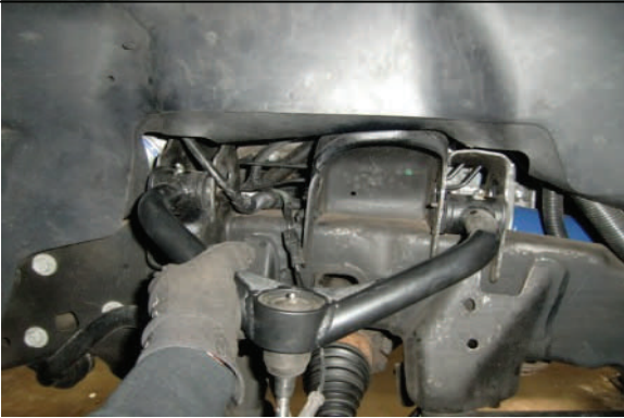
Install new upper control arm assembly with OE hardware