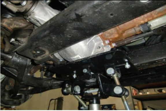
Support differential and remove differential mounting bolts