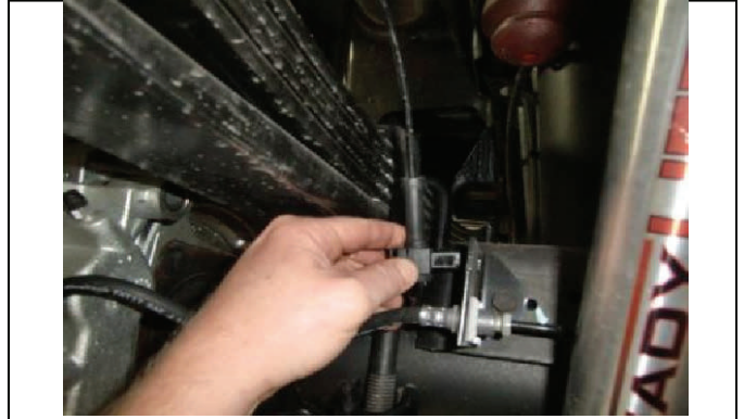
Unhook ABS wire from axle to prevent damage