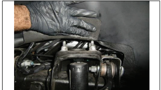
Push back soft fender liner to remove upper shock nuts.