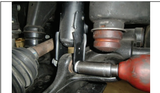
Loosen and remove lower shock hardware. New shocks req'd