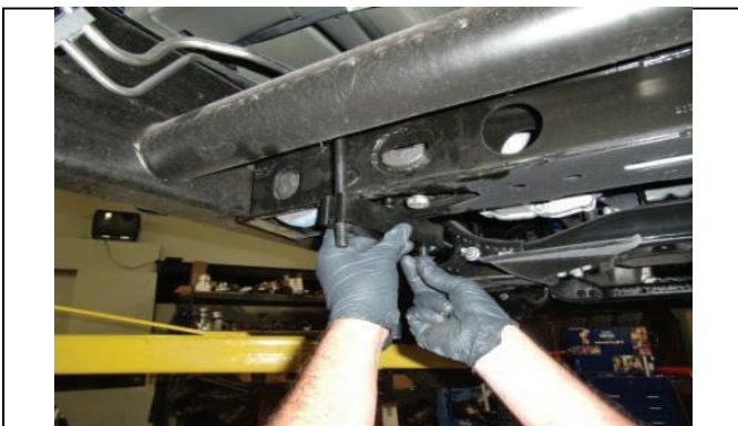
Position torsion bar unloading tool over cross member