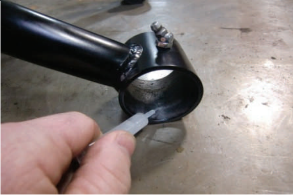
Install zerk fittings and apply grease to pivot tubes