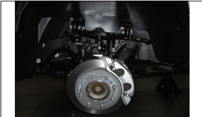
Securely lift vehicle and remove wheels