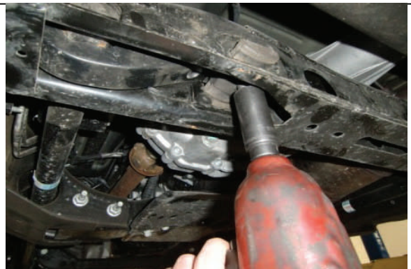
Adjust torsion bars to approx ride height