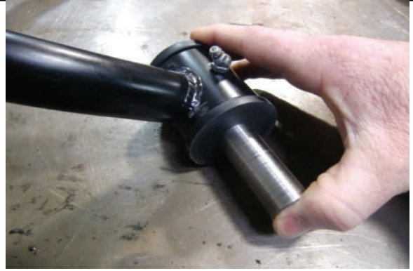
Assemble bushing halves and insert crush sleeves