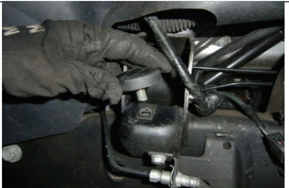
At forward control arm pocket attach clip and droop limiter.