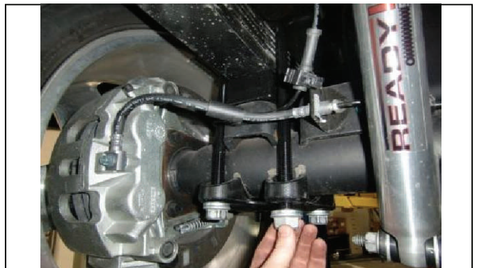
Install new longer u-bolts and install new hardware,