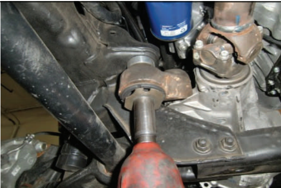
Install (4) differential drop spacers with new hardware