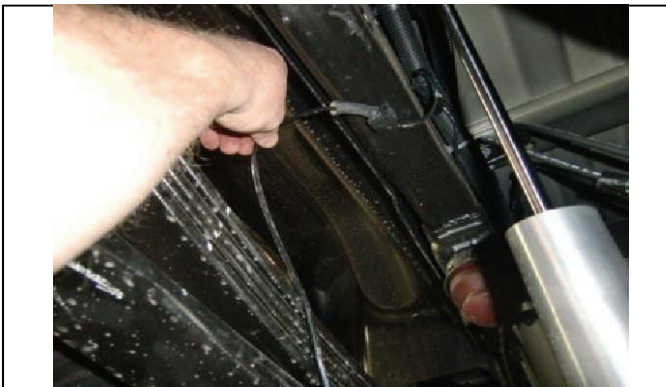
Slide ABS wire clip at frame to gain slack to avoid damage