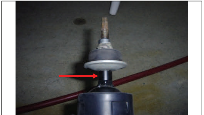
Install spacer underneath bottom shock bushings