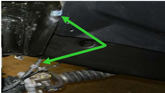
7. Unhook the differential breather tube from inside of the frame.