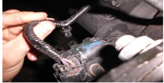
6. Unhook the wheel speed sensor wire line from the mount on the passengers side.