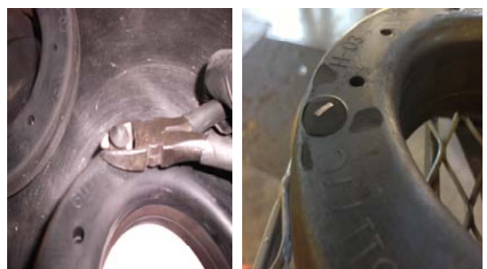
12. On OE spring isolator, cut off the rubber locating tab.