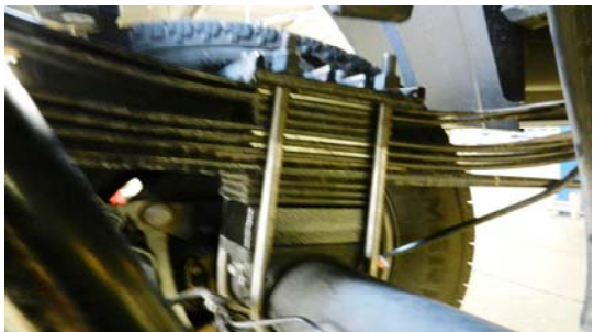
27. Install the mounting plate and longer u-bolts.