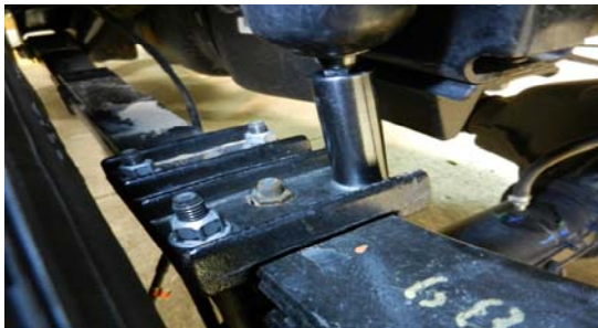
25. Unbolt the u-bolts and mounting plate from the axle.