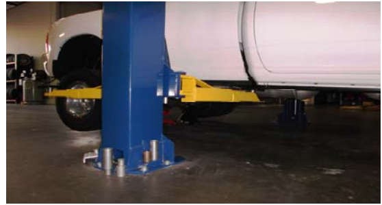
22. Lift the rear of the vehicle off the ground by the frame.