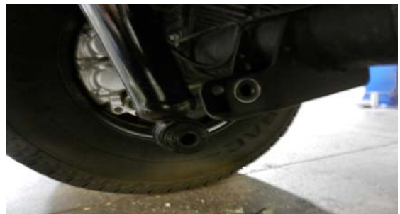
24. Unbolt the shocks from the frame and axle, then remove.