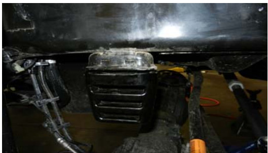
11. Install the ReadyLift 3" bump stops.