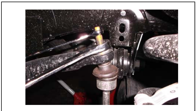
4. While front axle is supported, remove the sway bar end links.