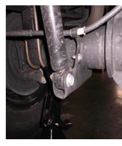
28. Reattach the shocks to the axle and frame.