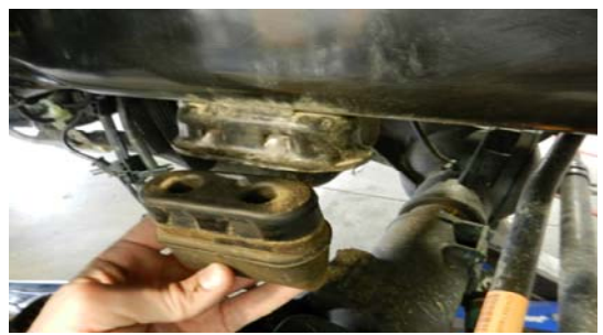
10. Remove the factory bump stops from the frame.