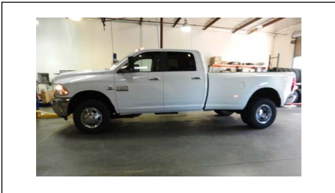
1. Front Install: Place the vehicle on level ground.

The Bill of Materials represents the component contents of this kit. All hardware is of the highest grade and the components are manufactured to exacting specifications for a trouble free installation. Use the attached torque specifications chart when final tightening of the nut and bolts are done.