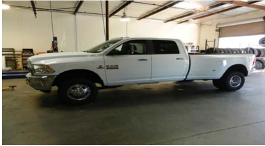
21. Rear Install: Place the vehicle on level ground.