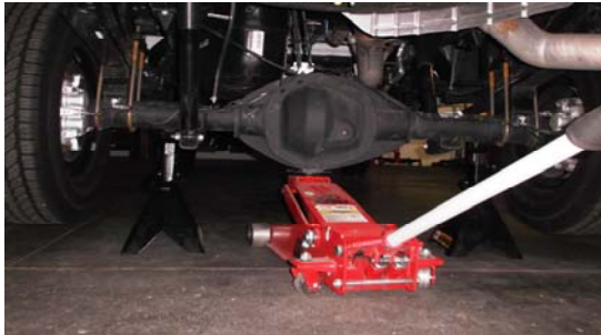
23. Support the rear axle.