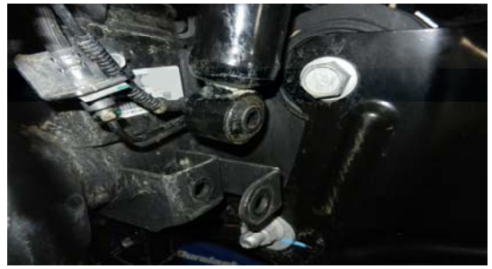
8. Unbolt the front shocks from the axle. Leave the tops bolted.