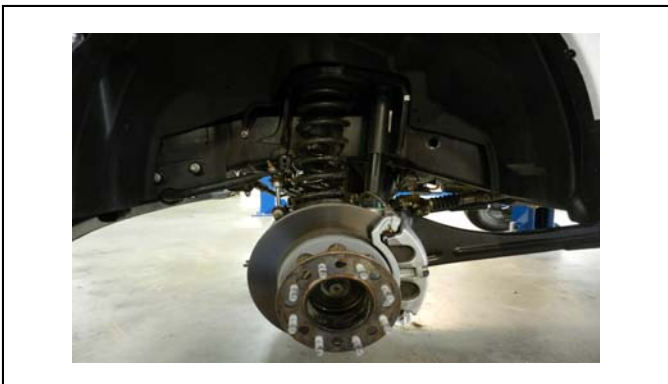
3. Remove the front wheels.