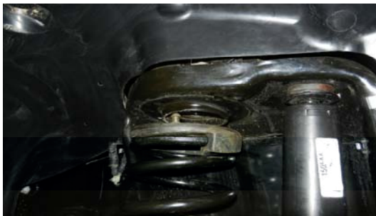
9. Lower the axle down to allow the front coil springs to be removed.