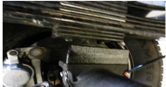
26. Lower the axle to make room to install the lift block.