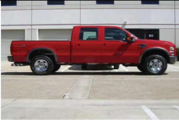
Position vehicle on level ground with steering wheel straight