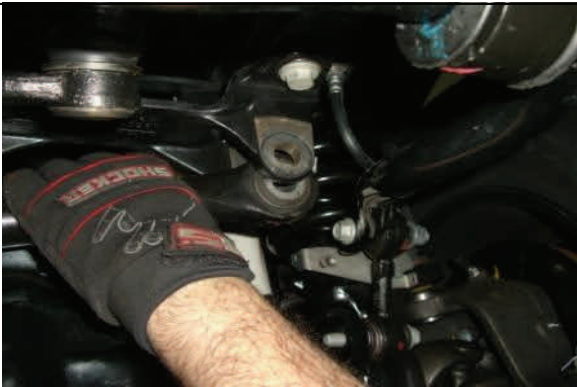
Pull down trac bar or use pry bar to disconnect