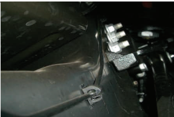
Remove (3) mounting nuts on cross member

Remove and replace bracket with new one in reverse order. It may be necessary to move the vehicle side to side in order to reattach trac bar in the new bracket. This can be done by starting the vehicle and carefully moving the steering wheel. Make sure to properly torque all hardware to factory spec. Have vehicle aligned.