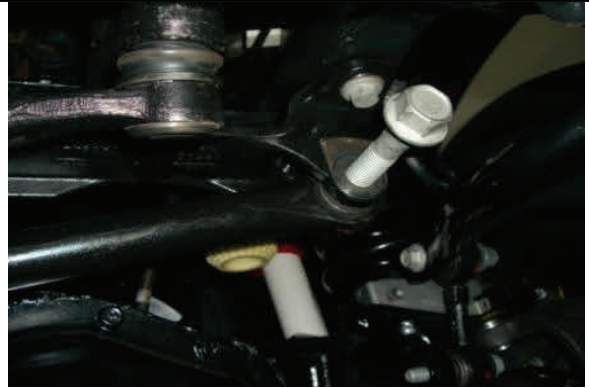
Remove upper trac bar hardware at frame